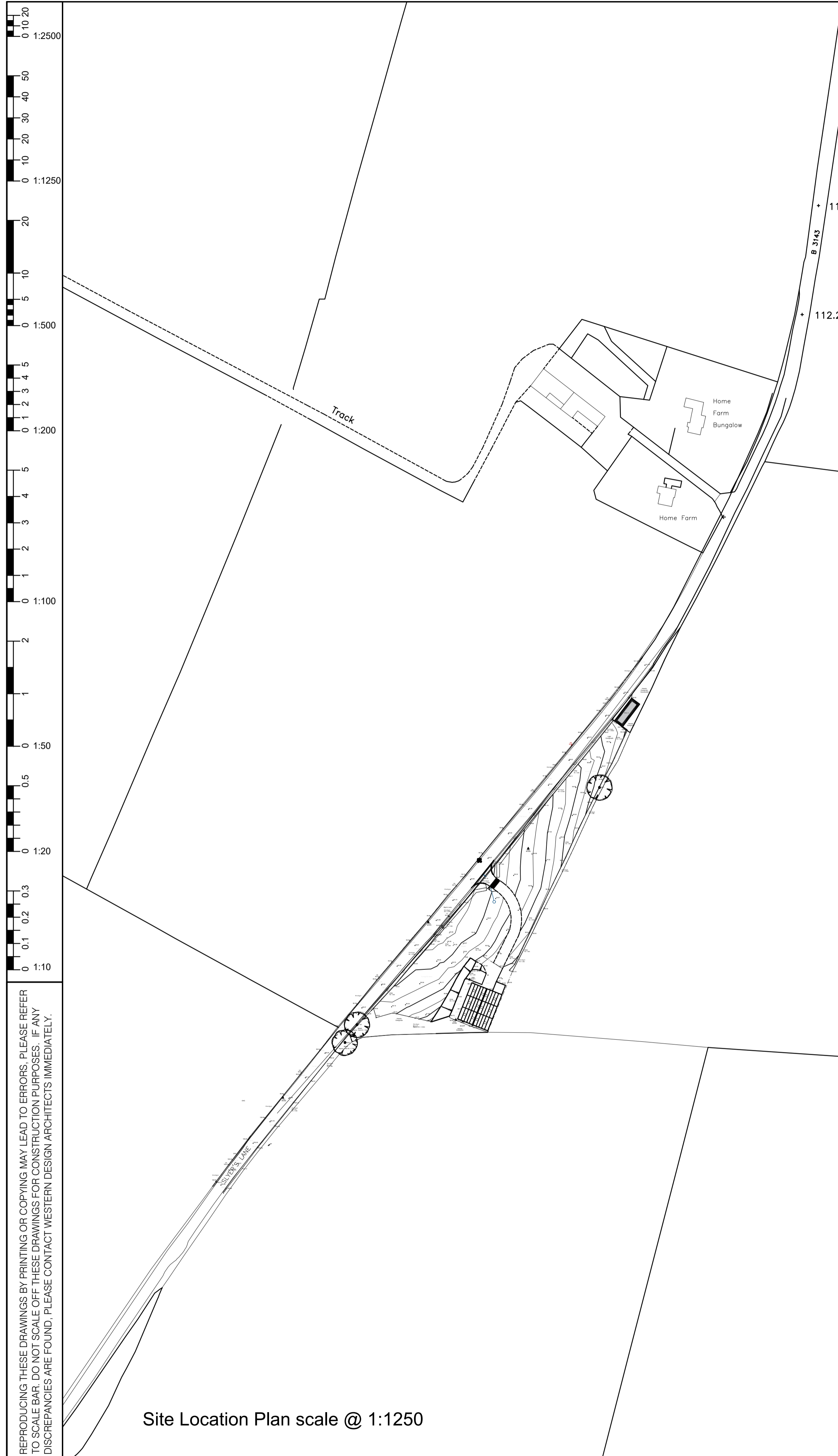
Site Location Plan scale @ 1:1250