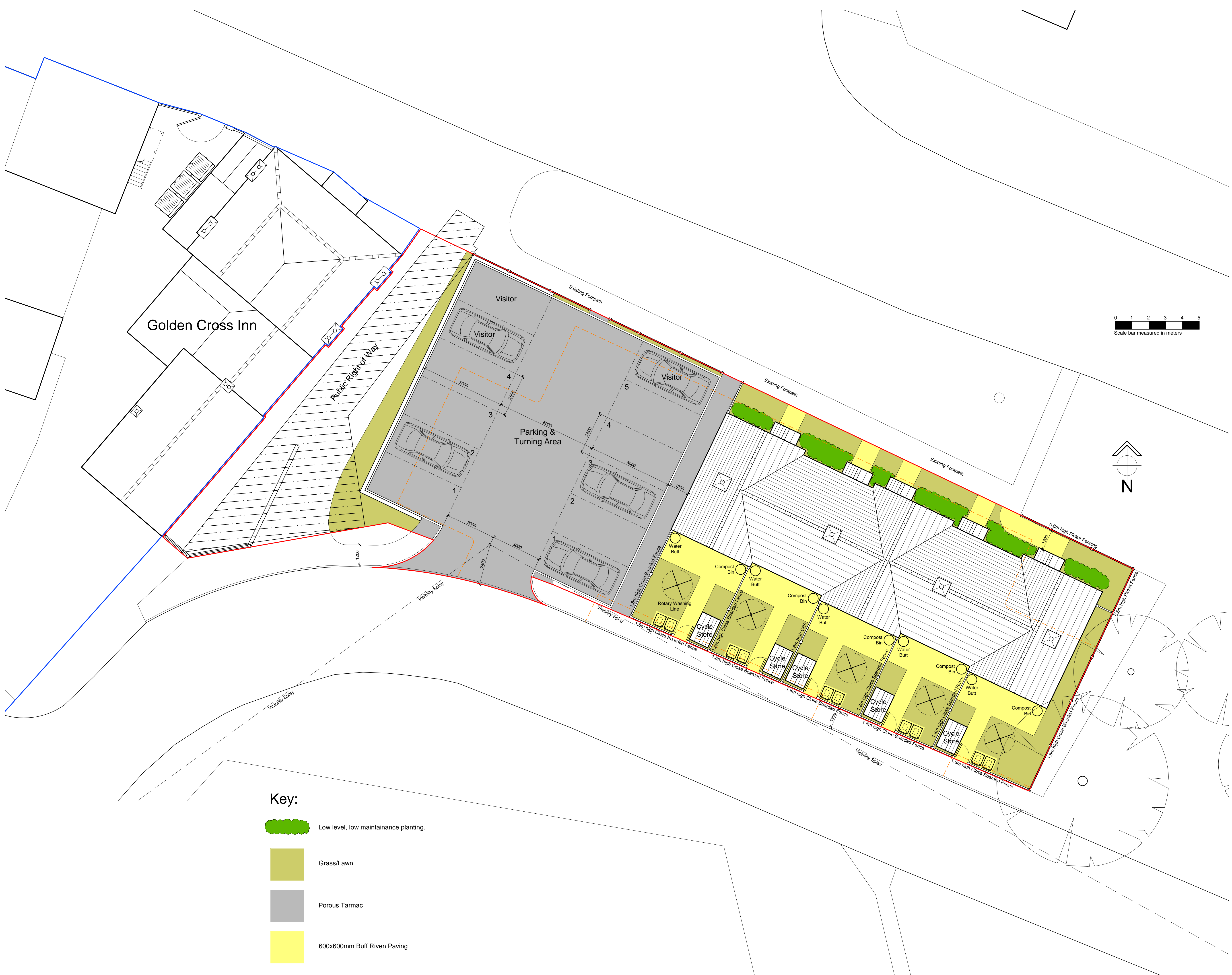
Proposed Site Layout Plan