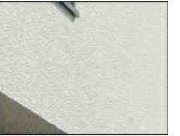
2. White Render