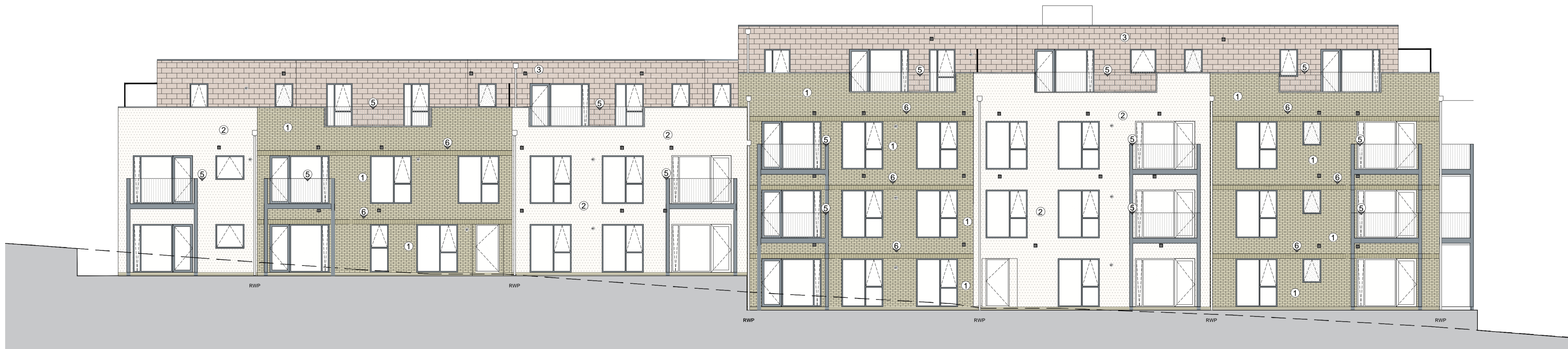
South west Elevation