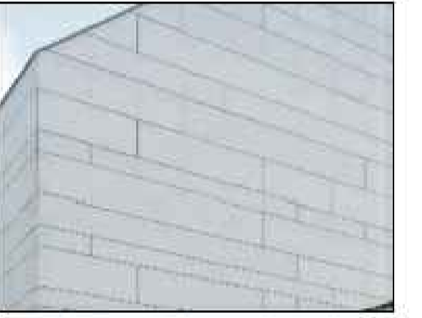
3. Equitone Linear Cladding