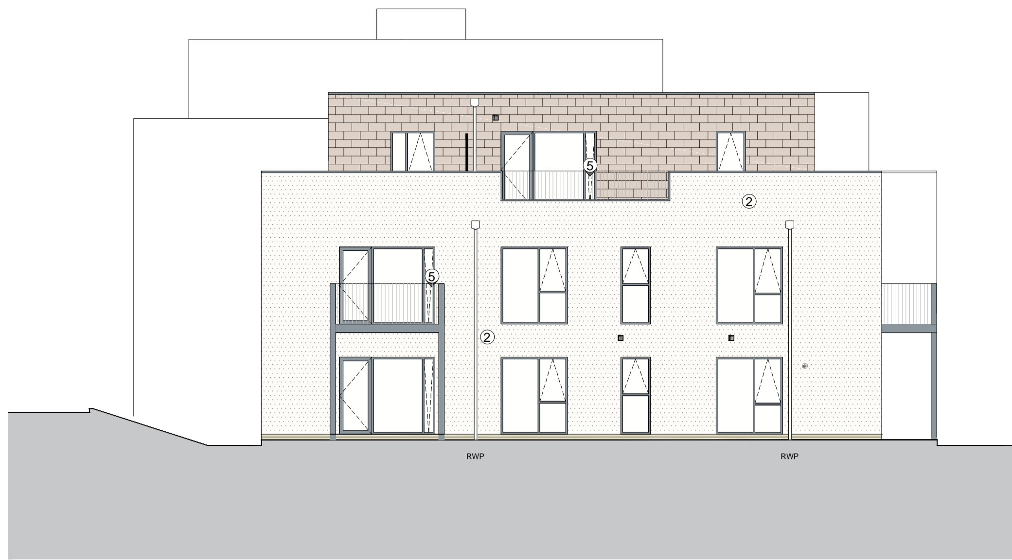
South east Elevation