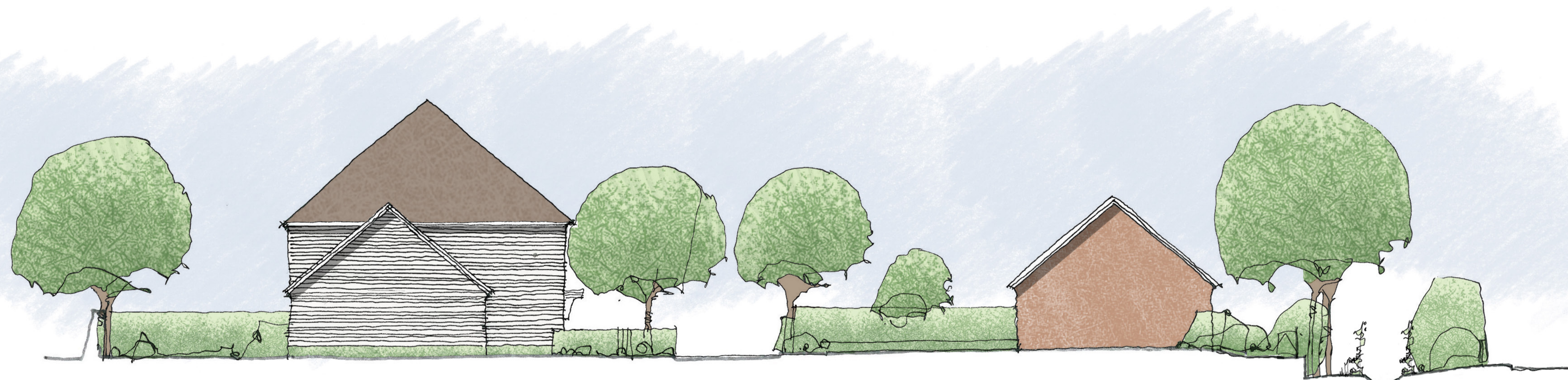
Site Sectional Elevation 10