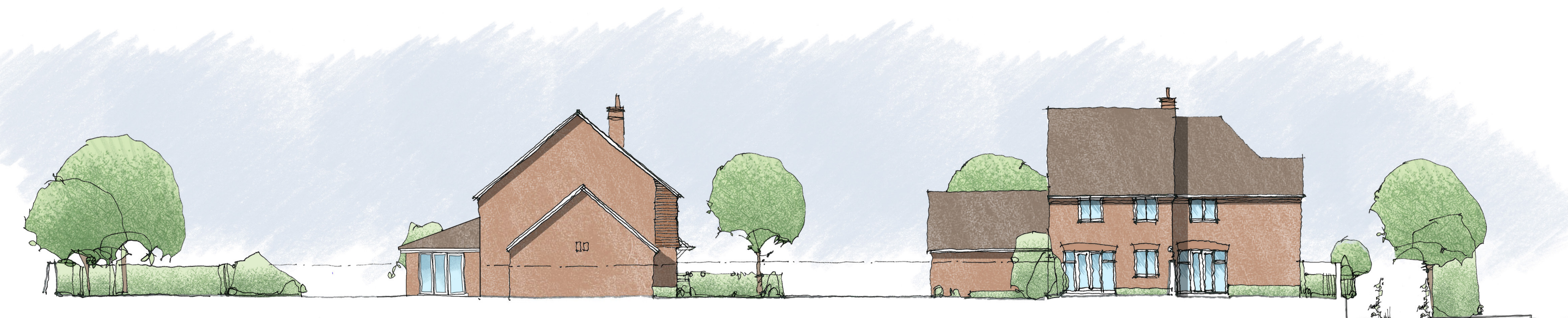
Site Sectional Elevation 4