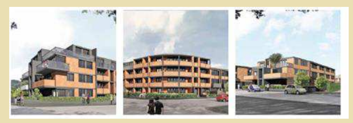
Artists Impression of Street Scenes

The consent was also subject to the signing of a Section 106 agreement which has been executed by the vendors