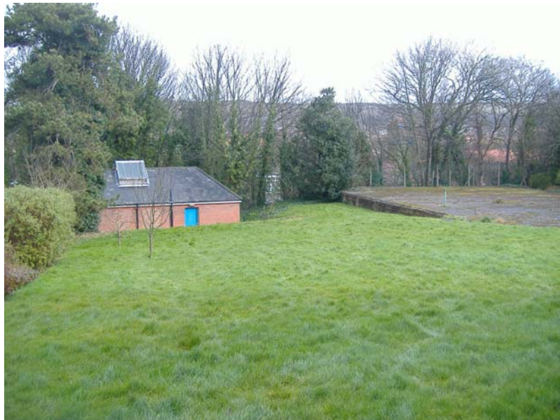
Plate 010 – View looking north towards mortuary building and dilapidated tennis court