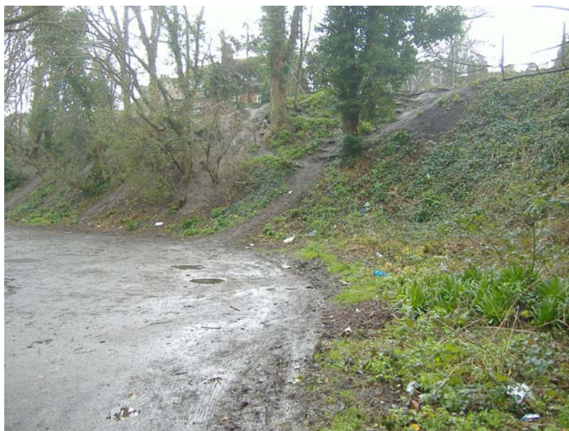
Plate 017 – View looking SE at slope in the north that is associated with the former quarry face