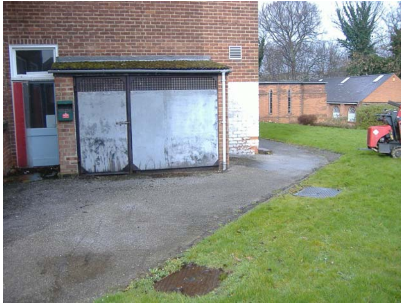
Plate 007 – View looking west at storage room previously used to store kitchen materials, fats and oils