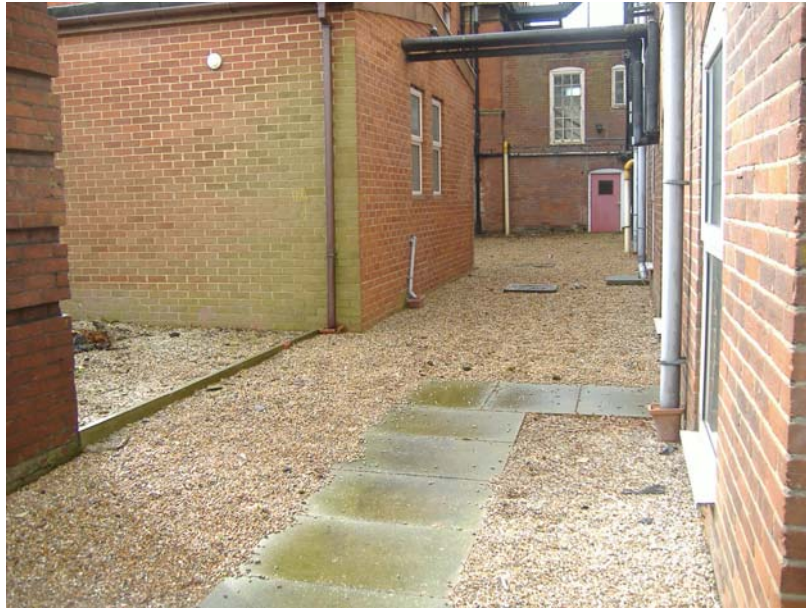
Plate 009 – View looking south along the western boundary of the site (location for WS7 is towards the end of this path and round to the left)