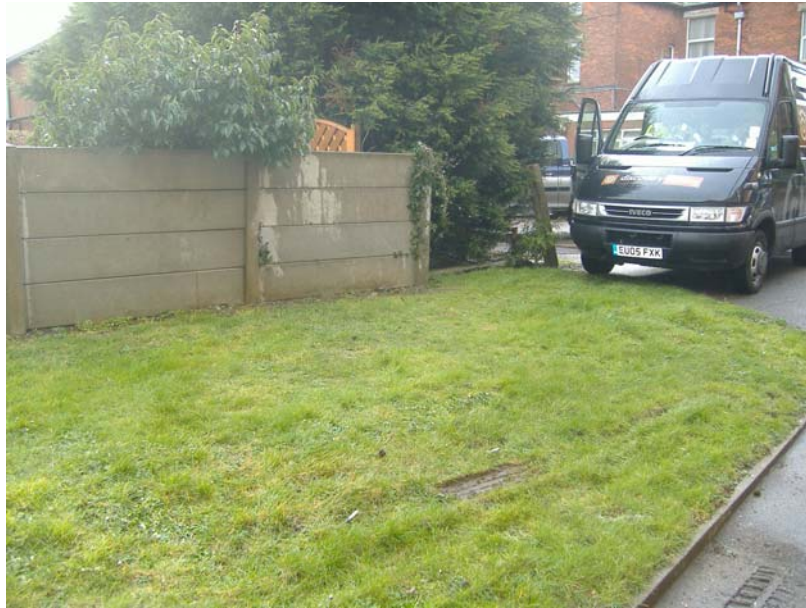
Plate 005 – View looking SE at retaining wall and location for WS1