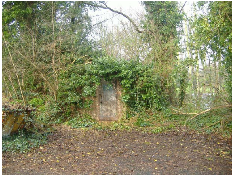
Plate 013 – View looking west at storage room previously used to store cleaning products and other solvents and location for WS3