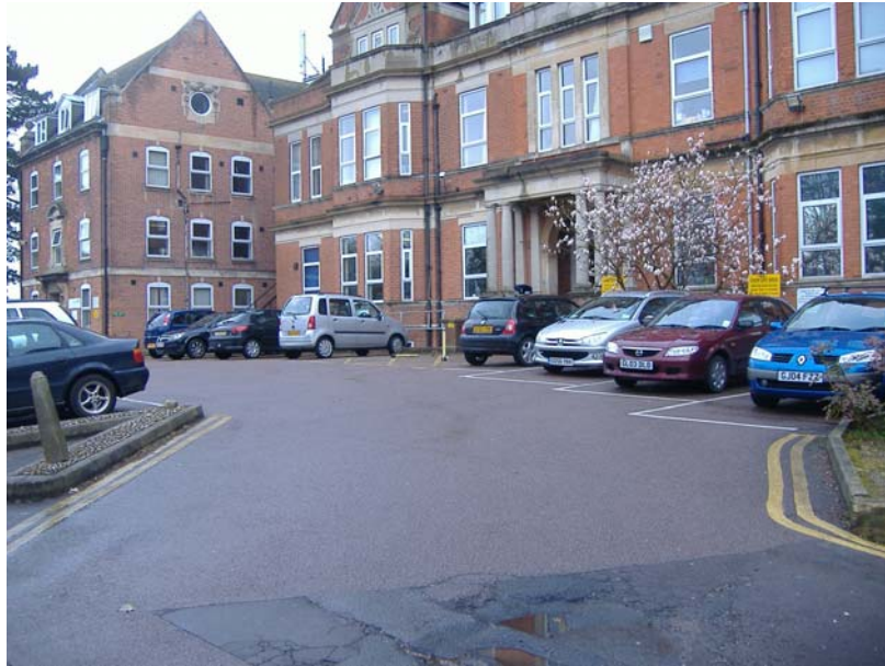
Plate 001 – View looking NE towards front of the hospital building