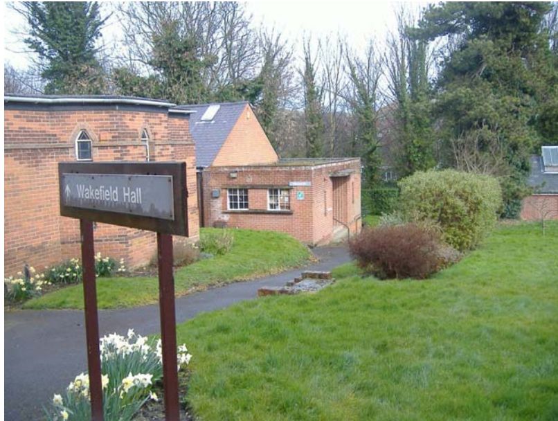
Plate 011 – View looking NW towards chapel and Wakefield Hall