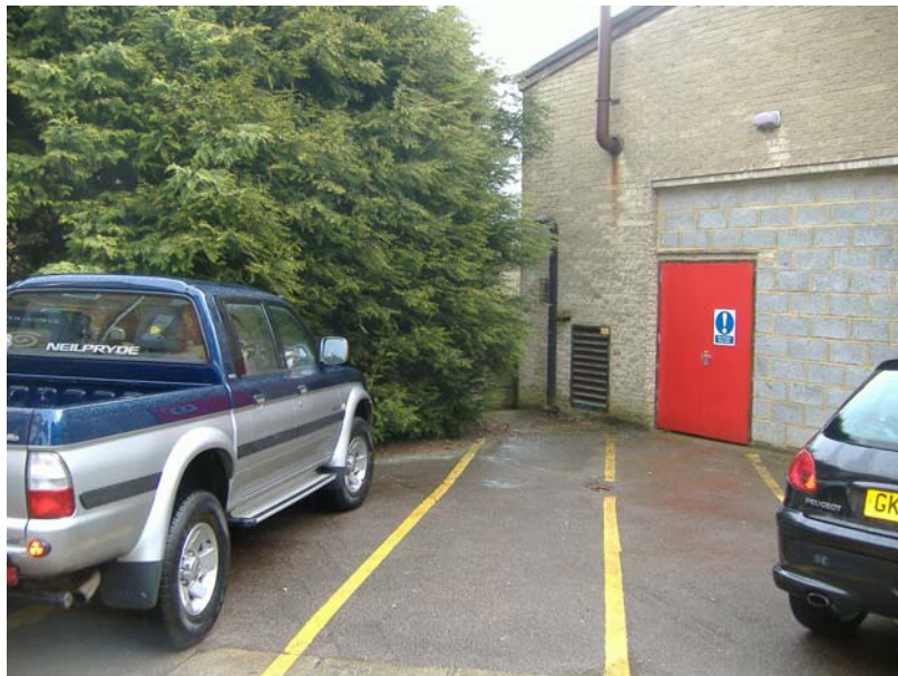
Plate 006 – View looking at off site storage room that was previously used to store hydrocarbons