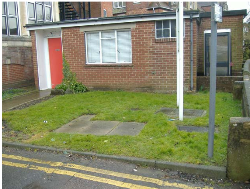
Plate 002 – View looking east from the front of the hospital building at location for WS6