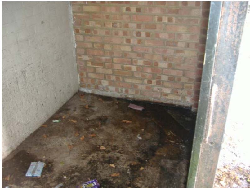
Plate 008 – View looking inside kitchen store room