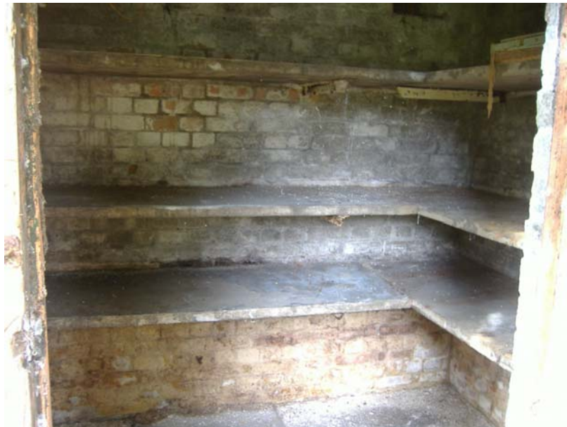
Plate 014 – View looking inside storage room