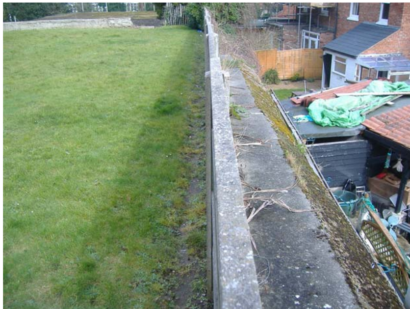
Plate 004 – View looking along the retaining wall structure at the eastern boundary of the site