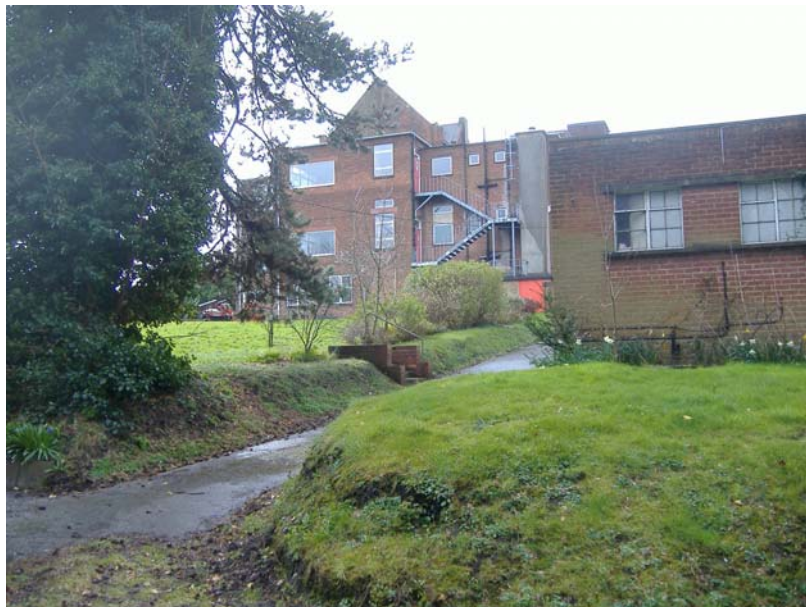
Plate 012 – View looking south towards the main hospital building