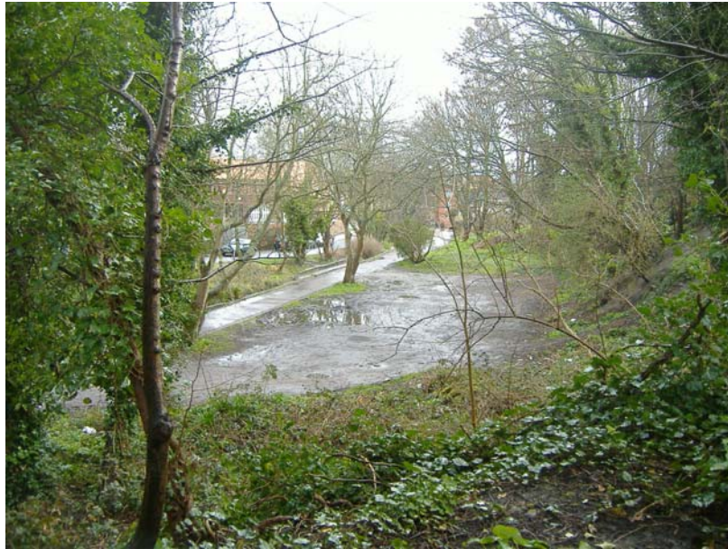
Plate 015 – View looking east at the northern lower elevated section of the site (location of WS4 and WS5)