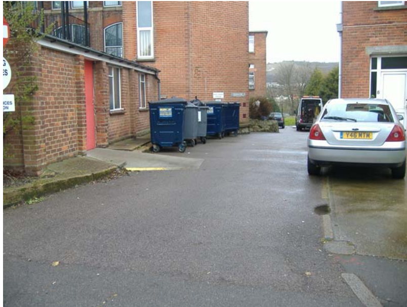
Plate 003 – View looking down the eastern side of the hospital building