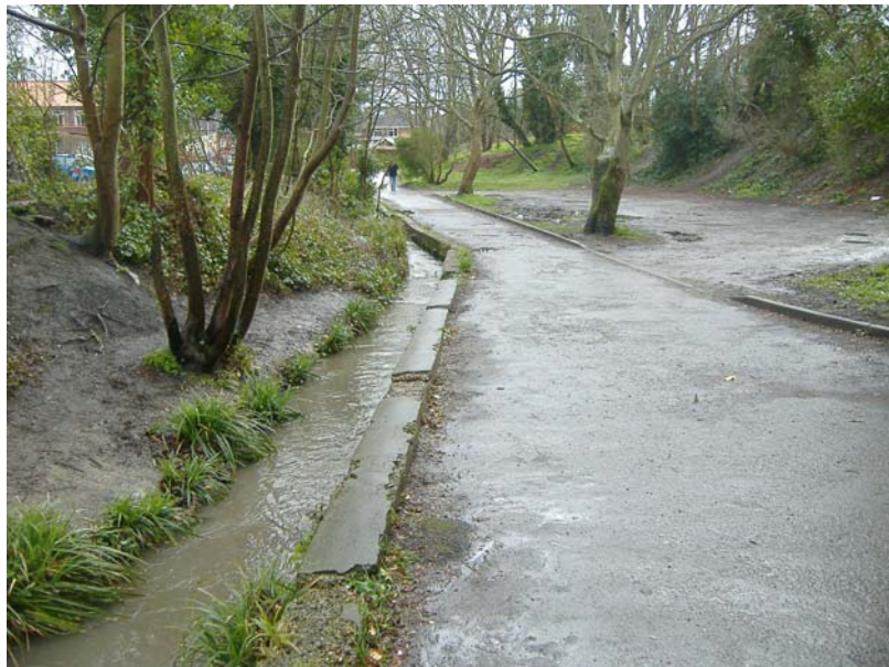
Plate 016 – View looking east at the northern lower elevated section of the site and Pent Stream just off site