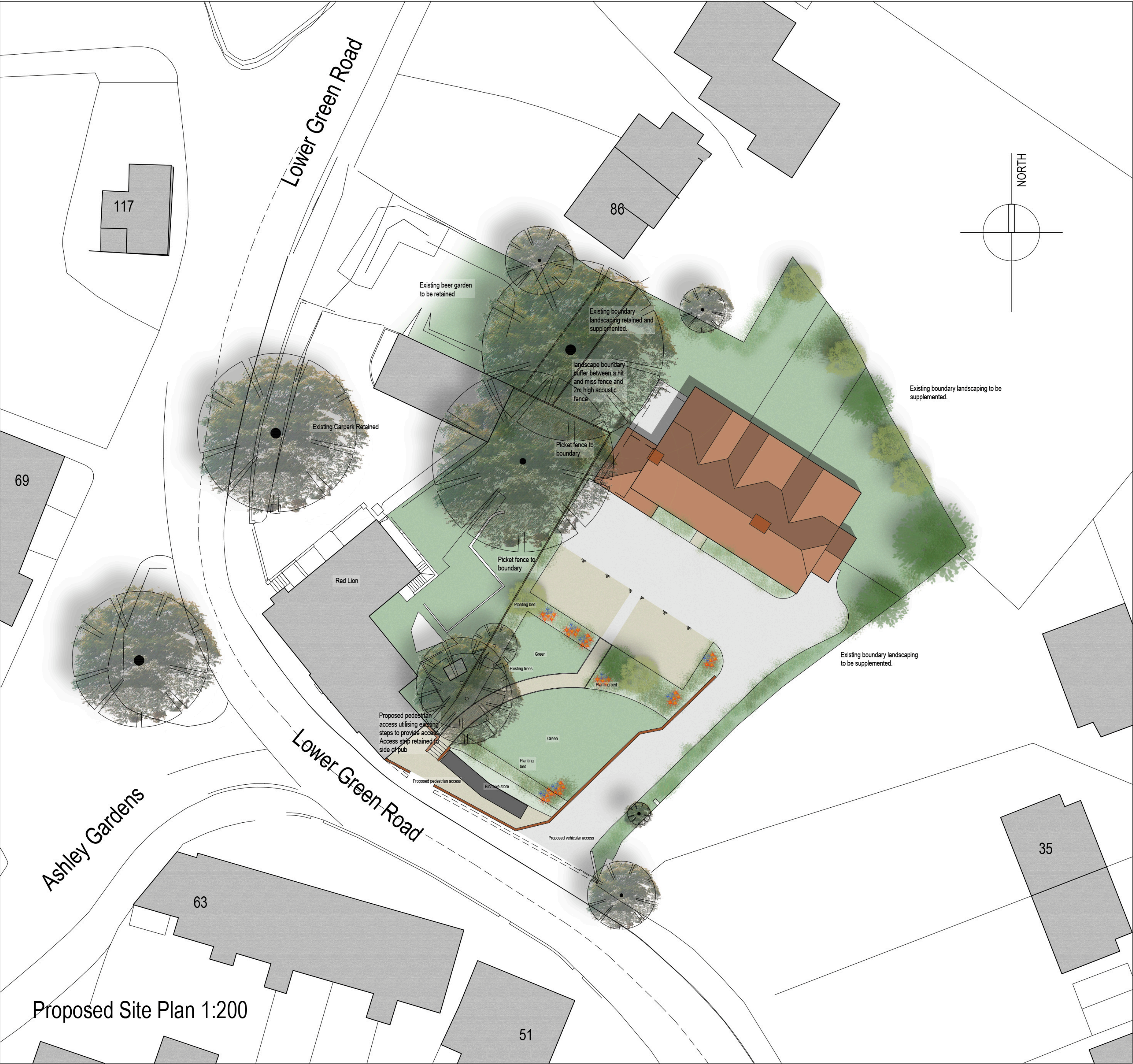
Proposed Site Plan 1:200