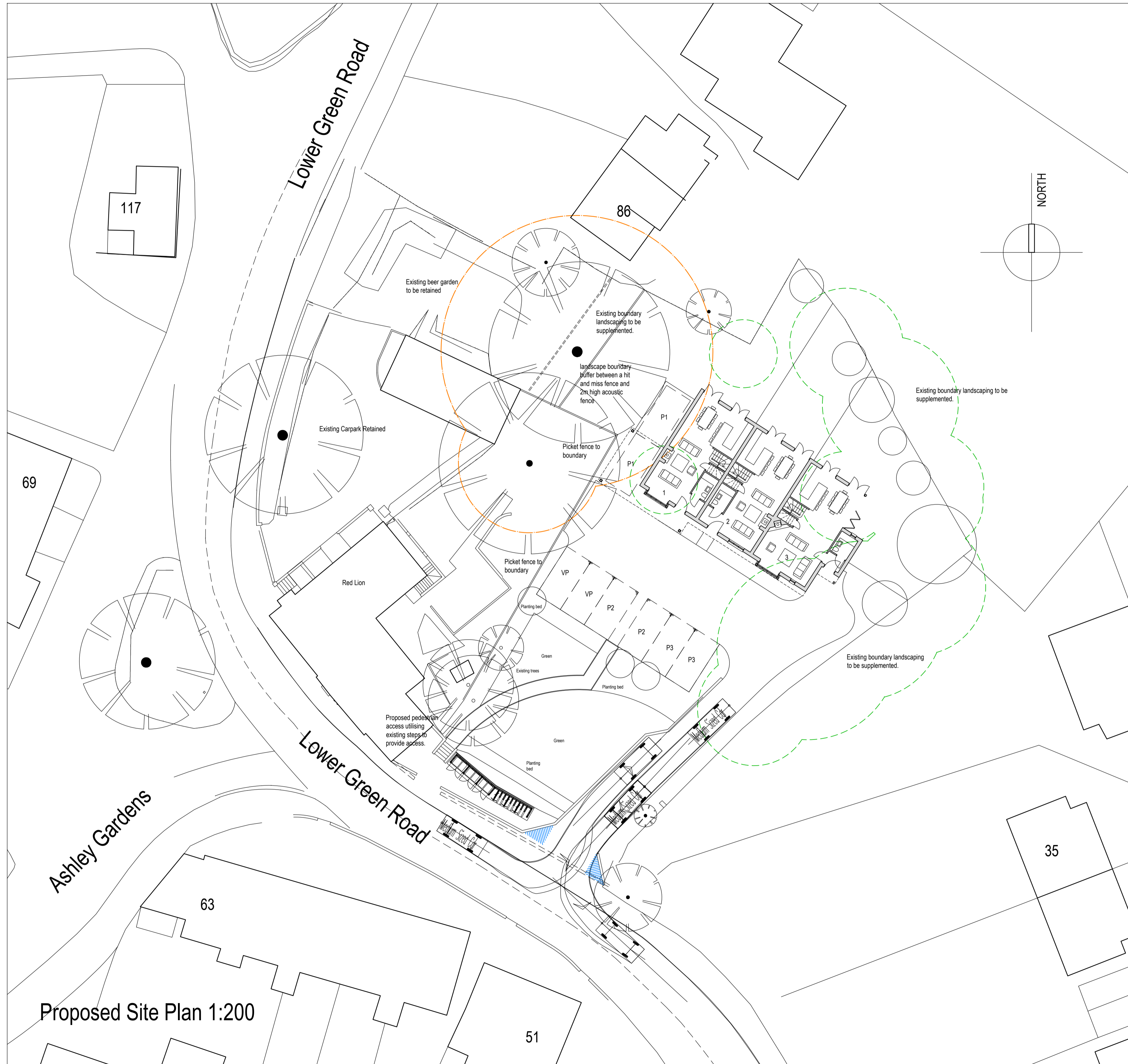
Proposed Site Plan 1:200