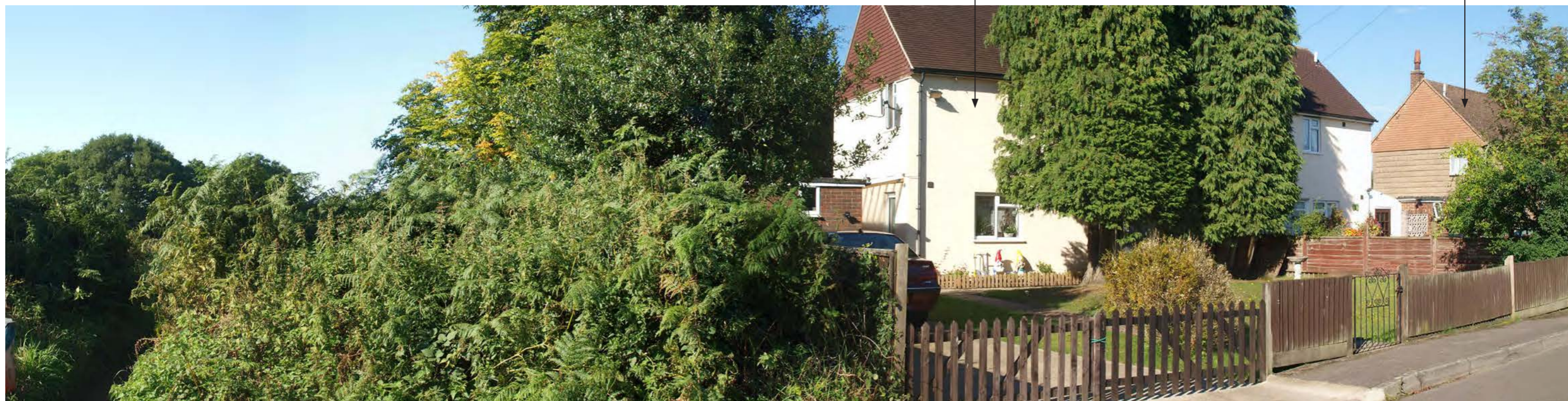
View from Wind Hill Lane looking south-west towards the Site - Viewpoint B