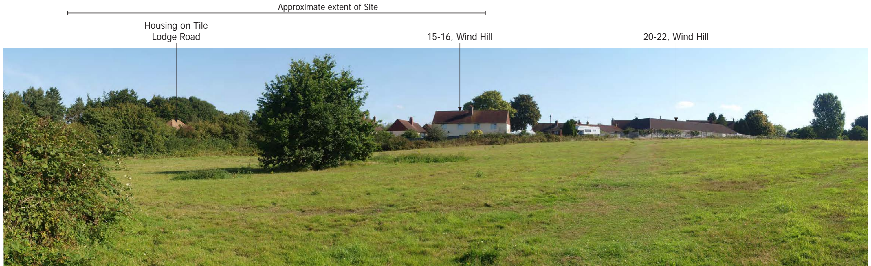
View from informal footpath looking north across the Site - Viewpoint D