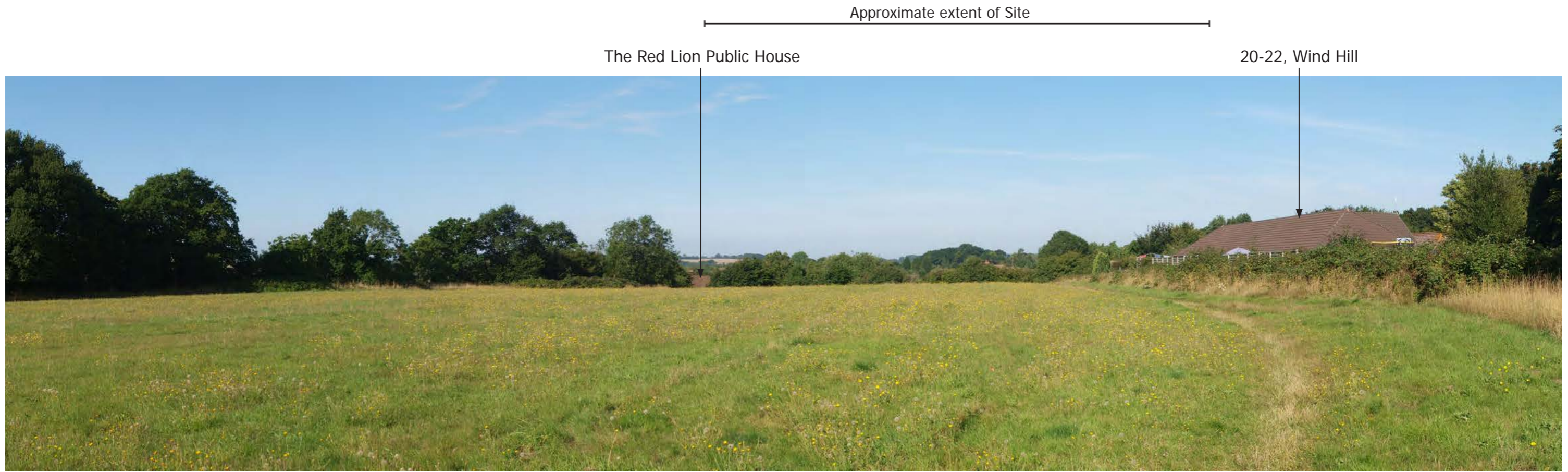
View from informal footpath looking east towards the Site - Viewpoint C