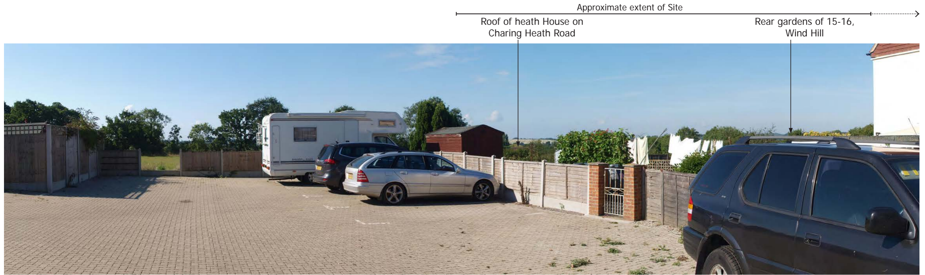
View from Wind Hill parking court looking south-west towards the Site - Viewpoint J