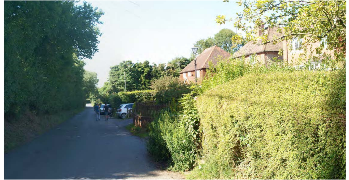
View from Tile Lodge Road looking south-west - Viewpoint G