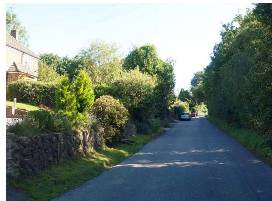
View from Tile Lodge Road looking north-east - Viewpoint F