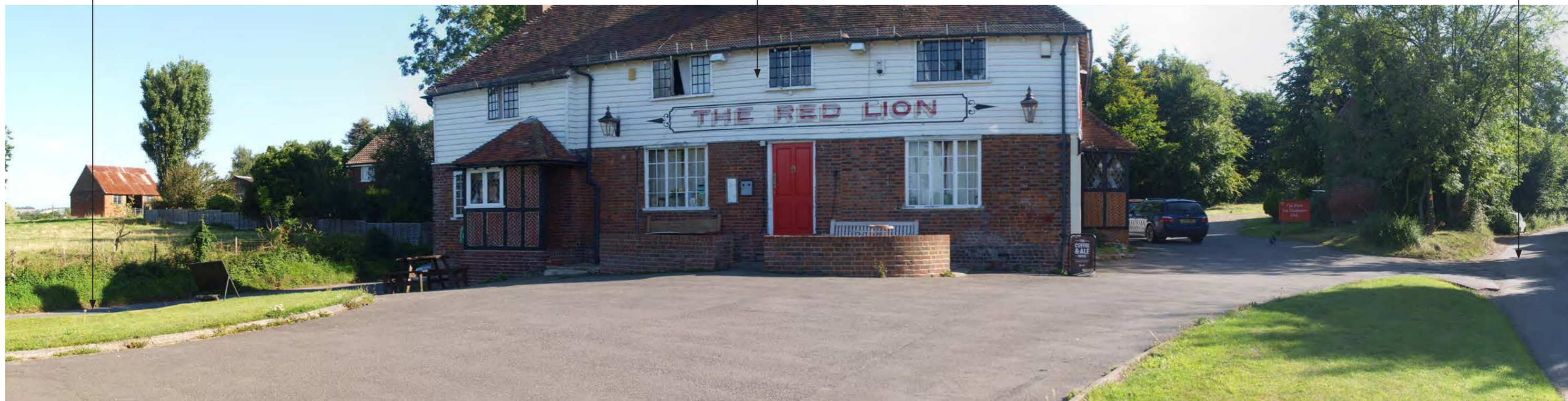
View from entrance to The Red Lion Public House off Charing Heath Road looking north-east towards the Site - Viewpoint A