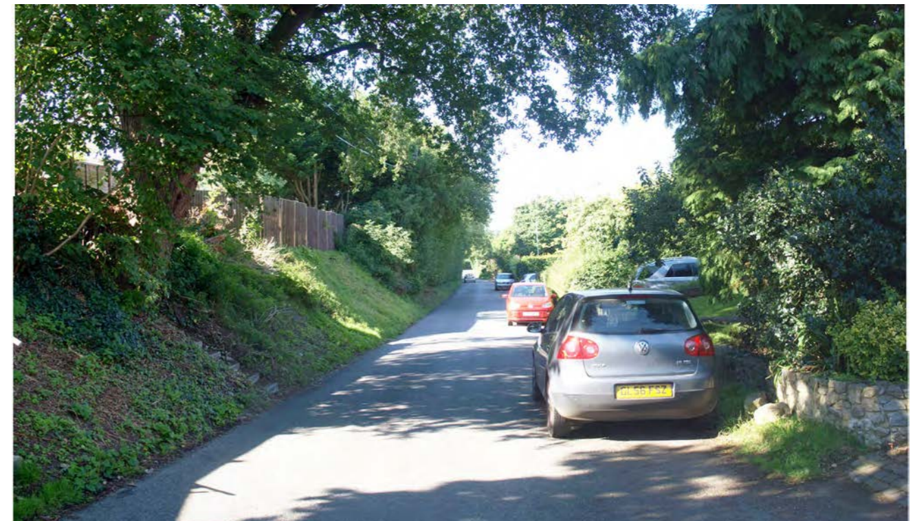
View from Tile Lodge Road looking south-west - Viewpoint H