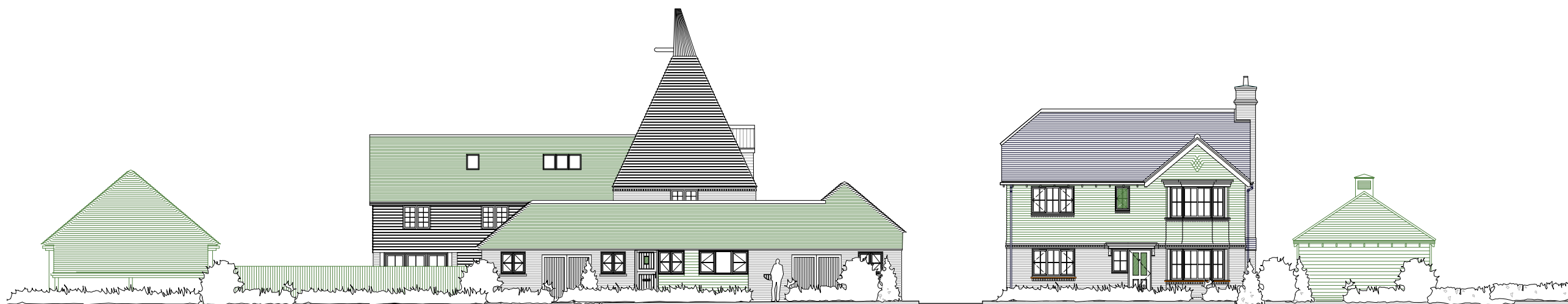
Pristling Road Street Scene