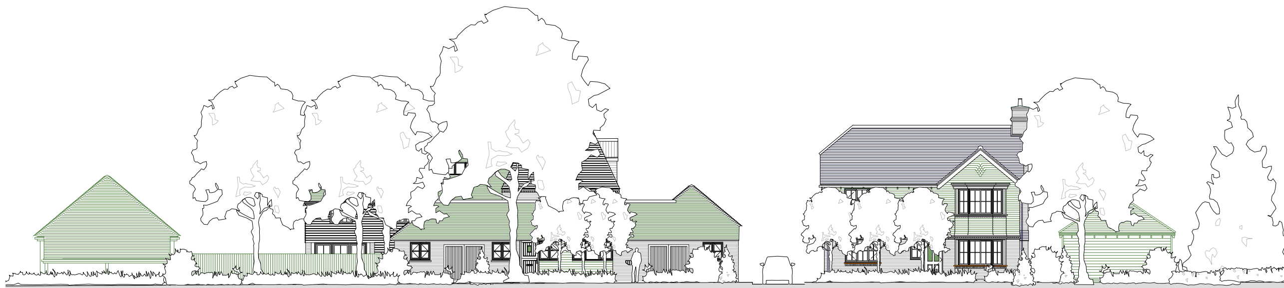
Pristling Road Street Scene with boundary planting