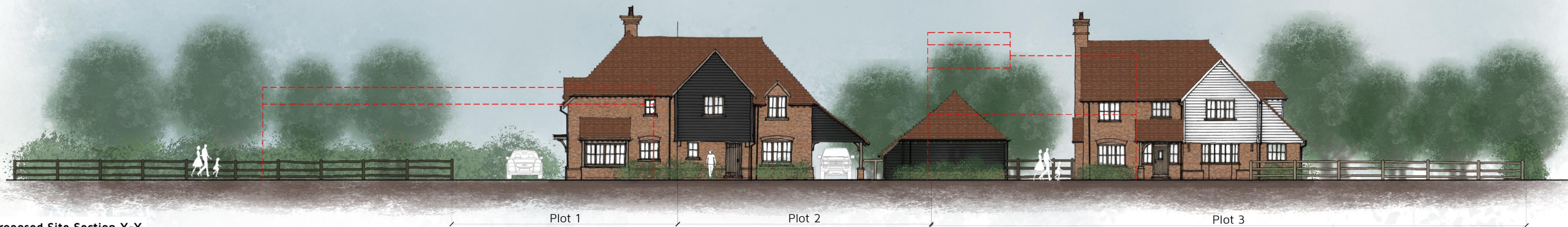
Proposed Site Section Y-Y 1:250 @ A3