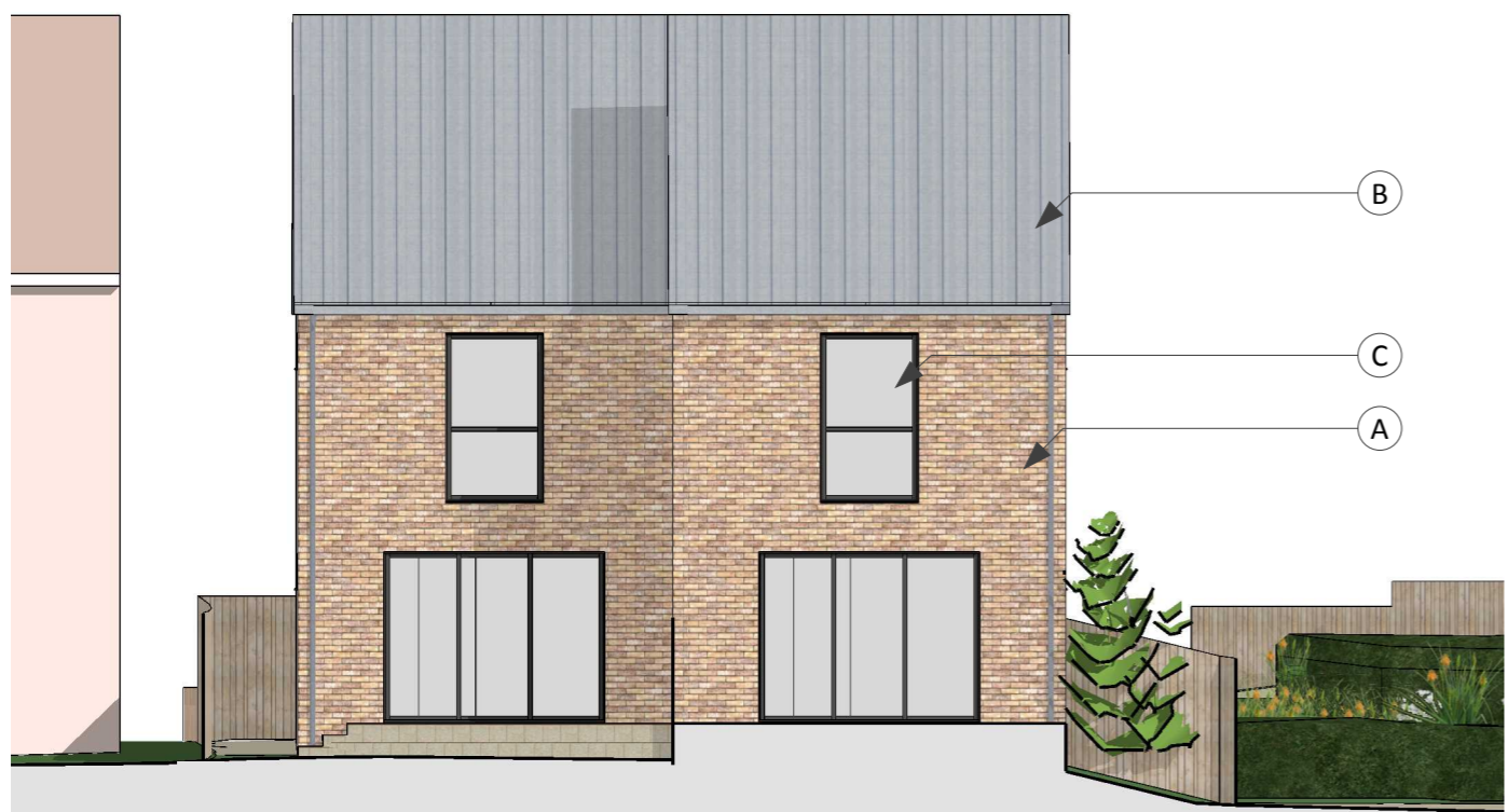
Block C - North West Elevation