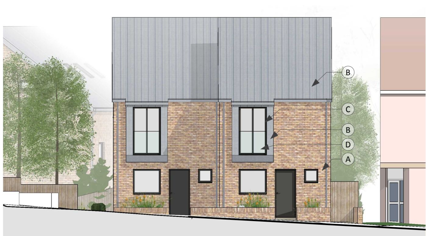
Block C - South East Elevation