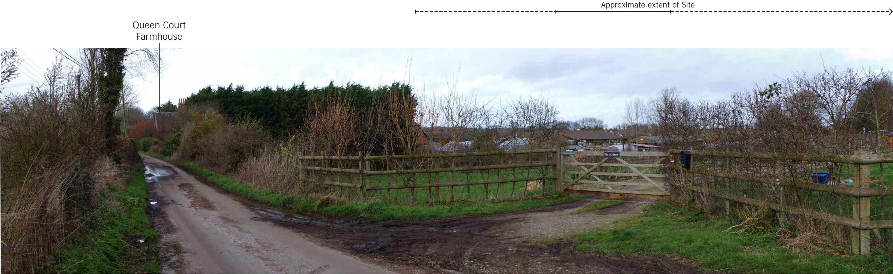
View from From Vicarage Lane looking north west - Viewpoint K