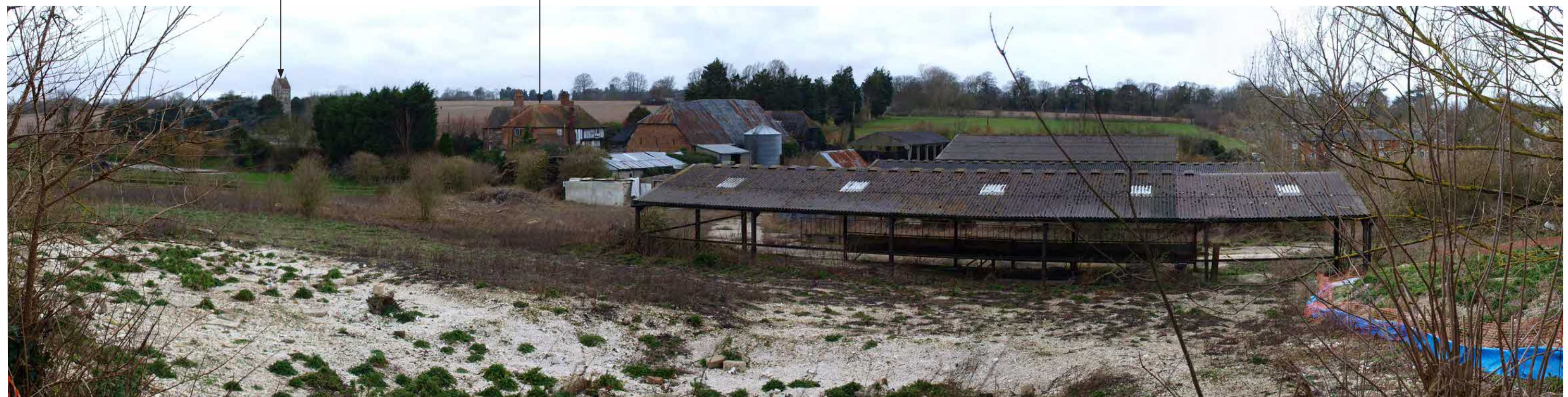
View from Mutton Lane looking west - Viewpoint P