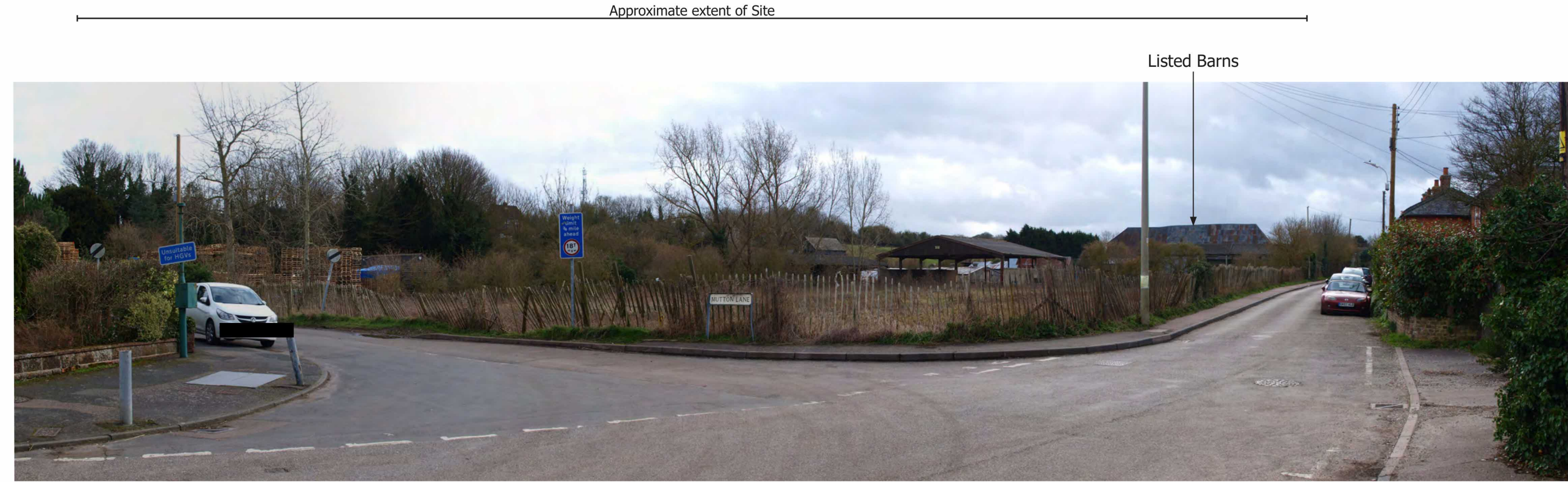
View from Water Lane at Junction with Mutton Lane looking south - Viewpoint B