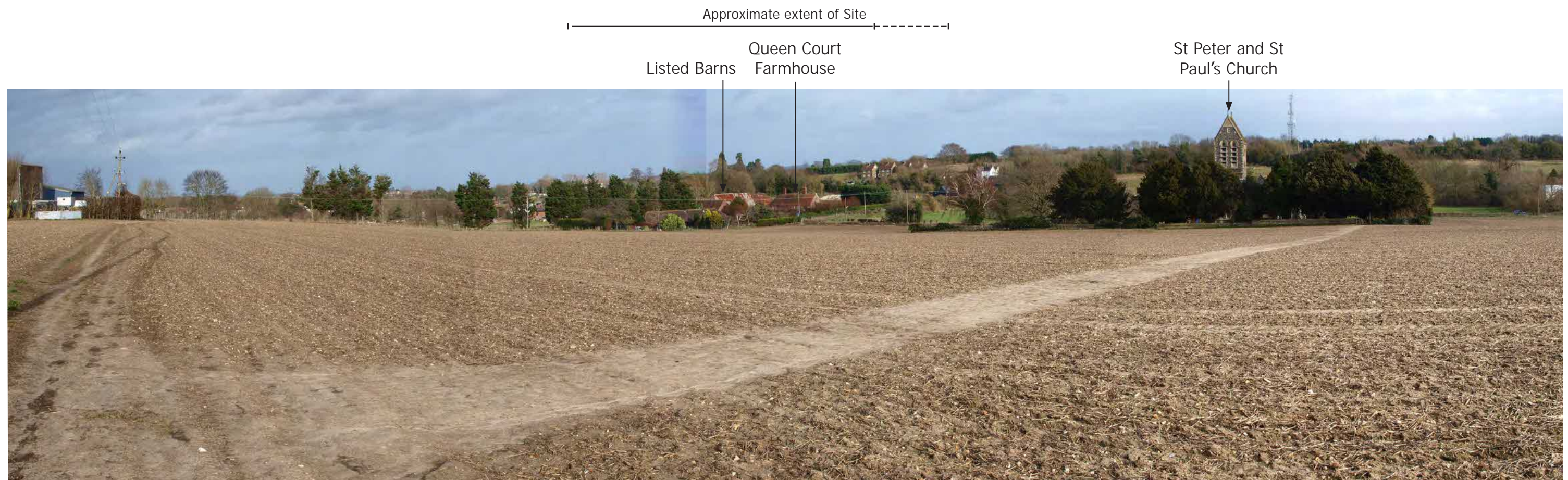
View from From Footpath ZF13 looking north-east over Nailbourne Valley - Viewpoint H