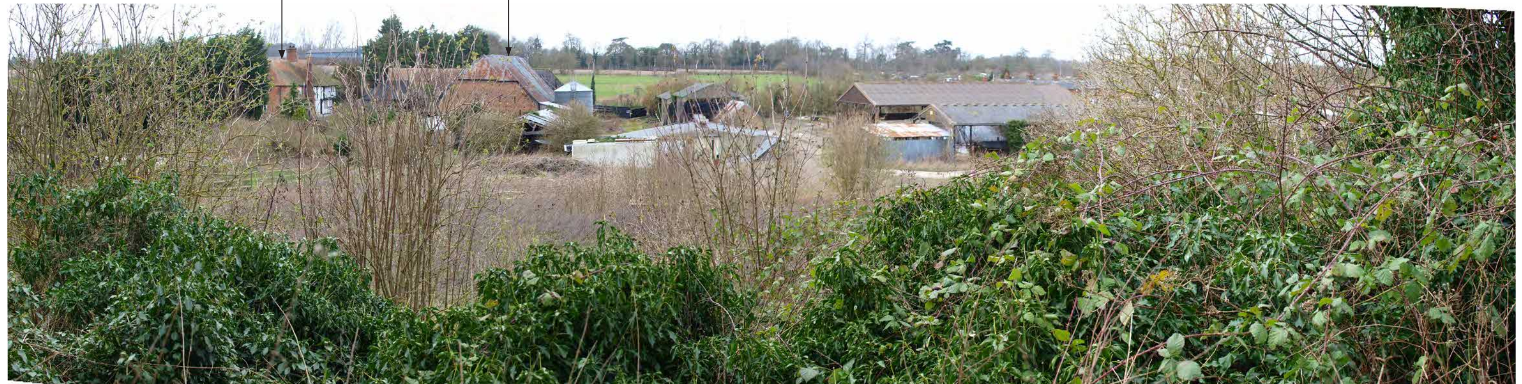
View from Vicarage Lane looking north-east over Nailbourne Valley - Viewpoint M