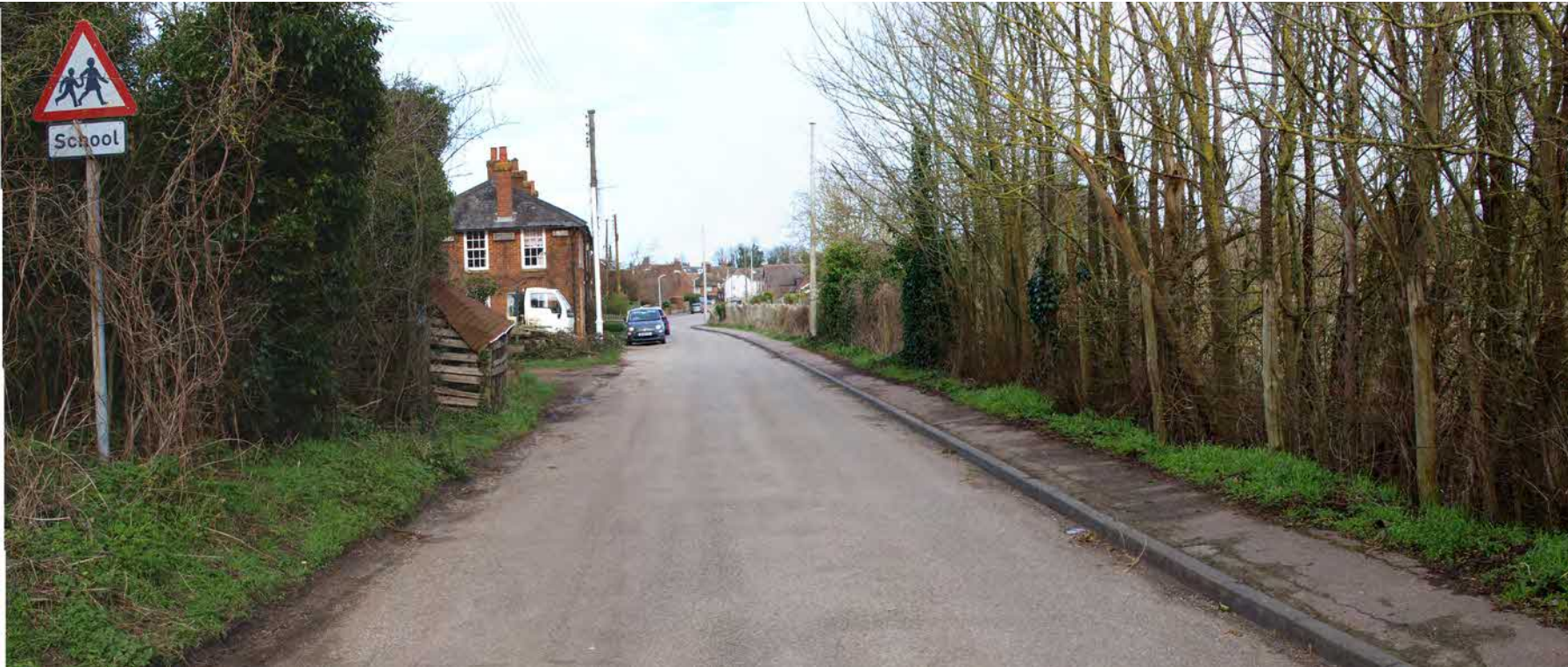
View from Water Lane looking north - Viewpoint D