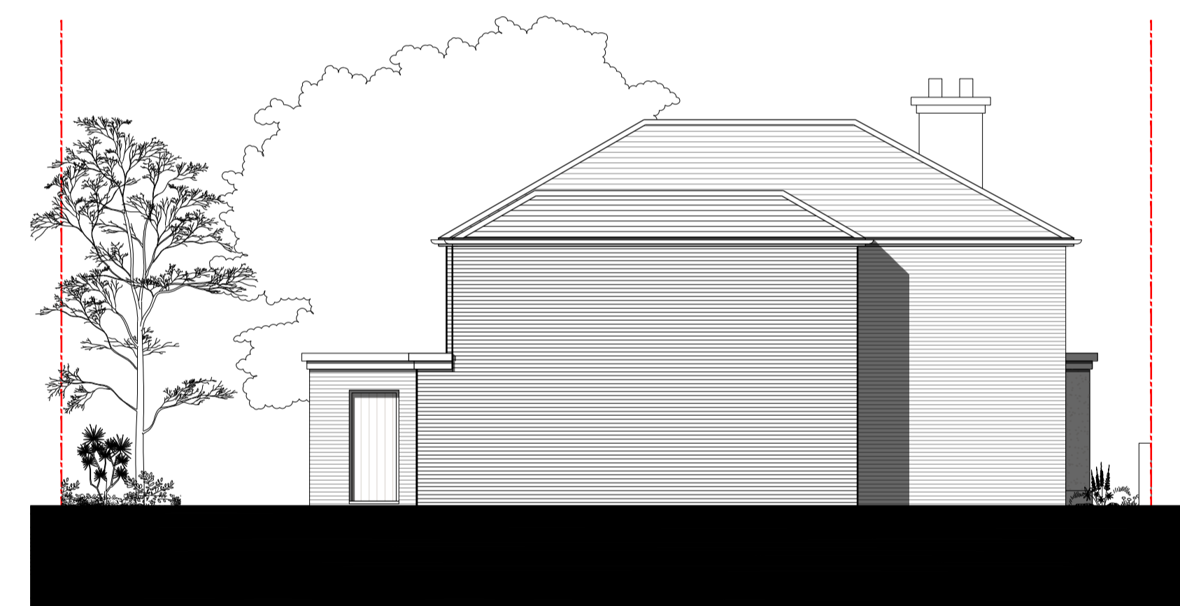
4 ELEVATION SIDE (SOUTH EAST) ELEVATION SCALE 1: 100