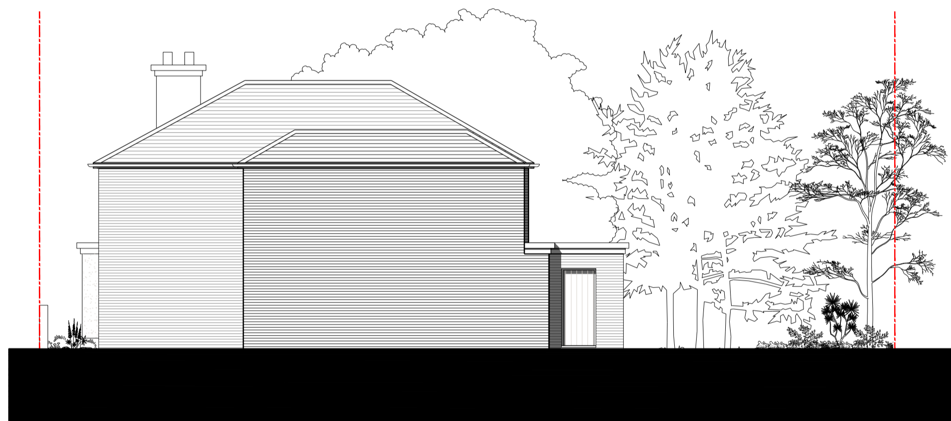
2 ELEVATION SIDE (NORTH WEST) ELEVATION SCALE 1: 100