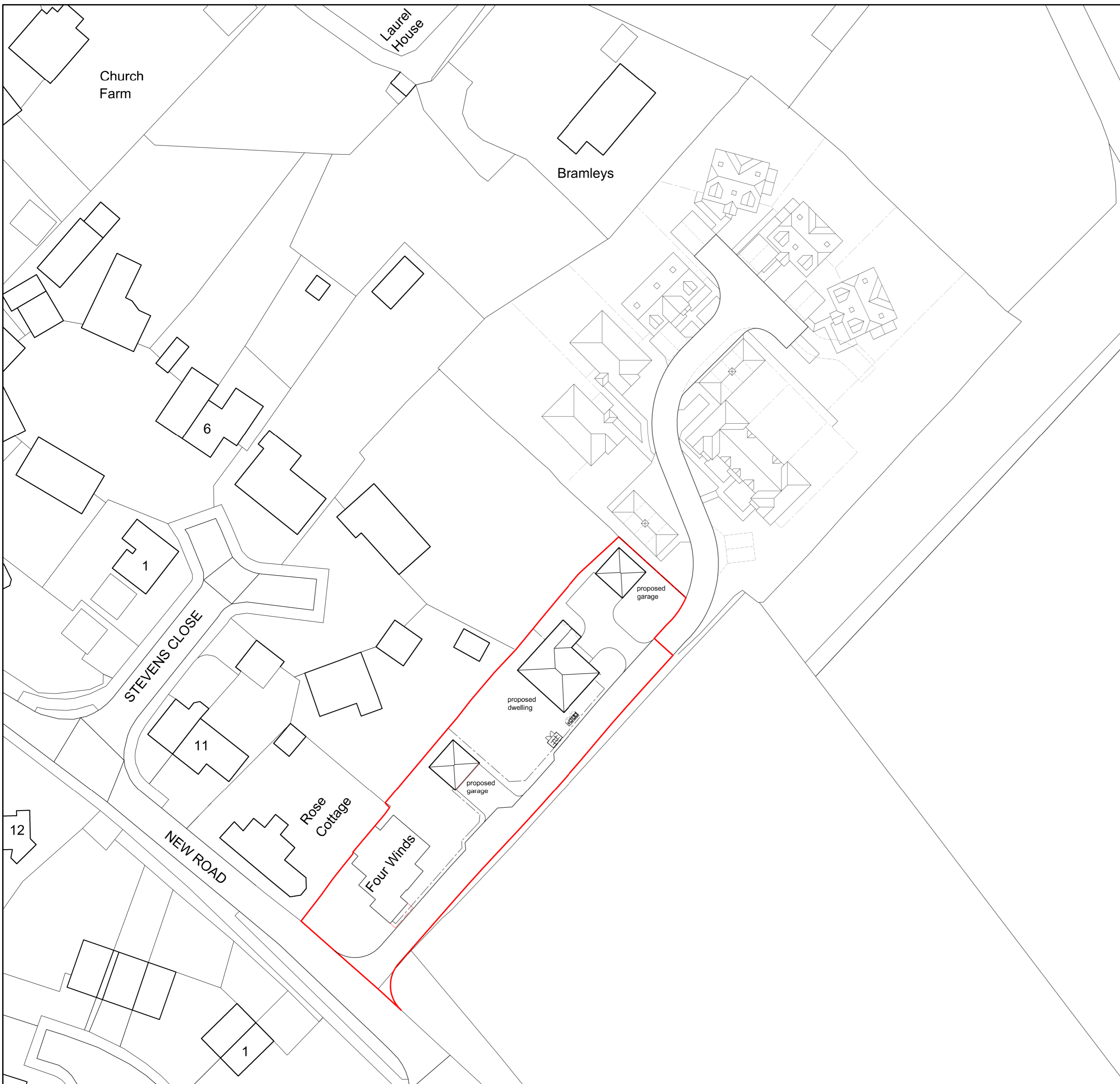
Proposed block plan scale 1:500 Scale 1:500