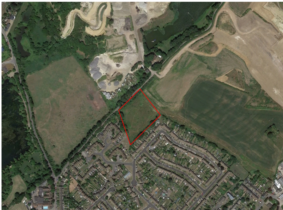
Figure 1: Site location (site boundary indicative).