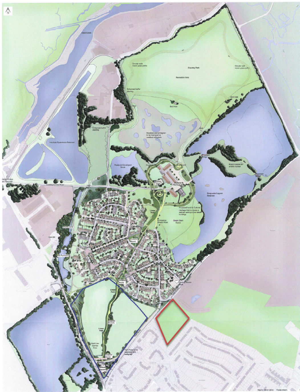
Figure 2: Illustrative masterplan for former Oare Gravel Works.