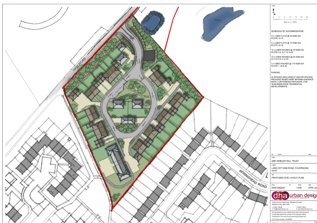
Figure 3: Indicative site layout.

3.3.3 Being indicative only, the layout will be subject to refinement during the course of a subsequent reserved matters application. However it demonstrates at this stage that an appropriately policy compliant number of dwellings can be adequately accommodated on the site.