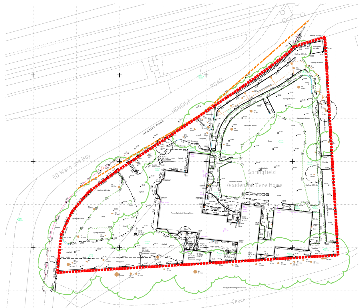
Site block plan 1:500