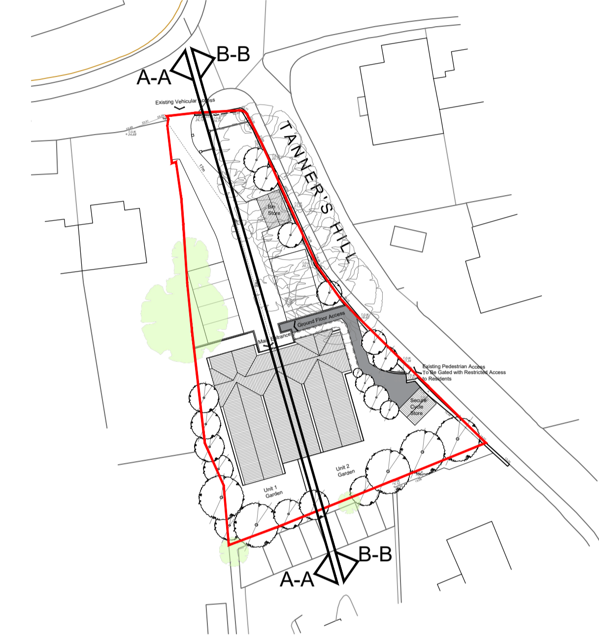
03 Proposed Site Location Plan SCALE 1:500