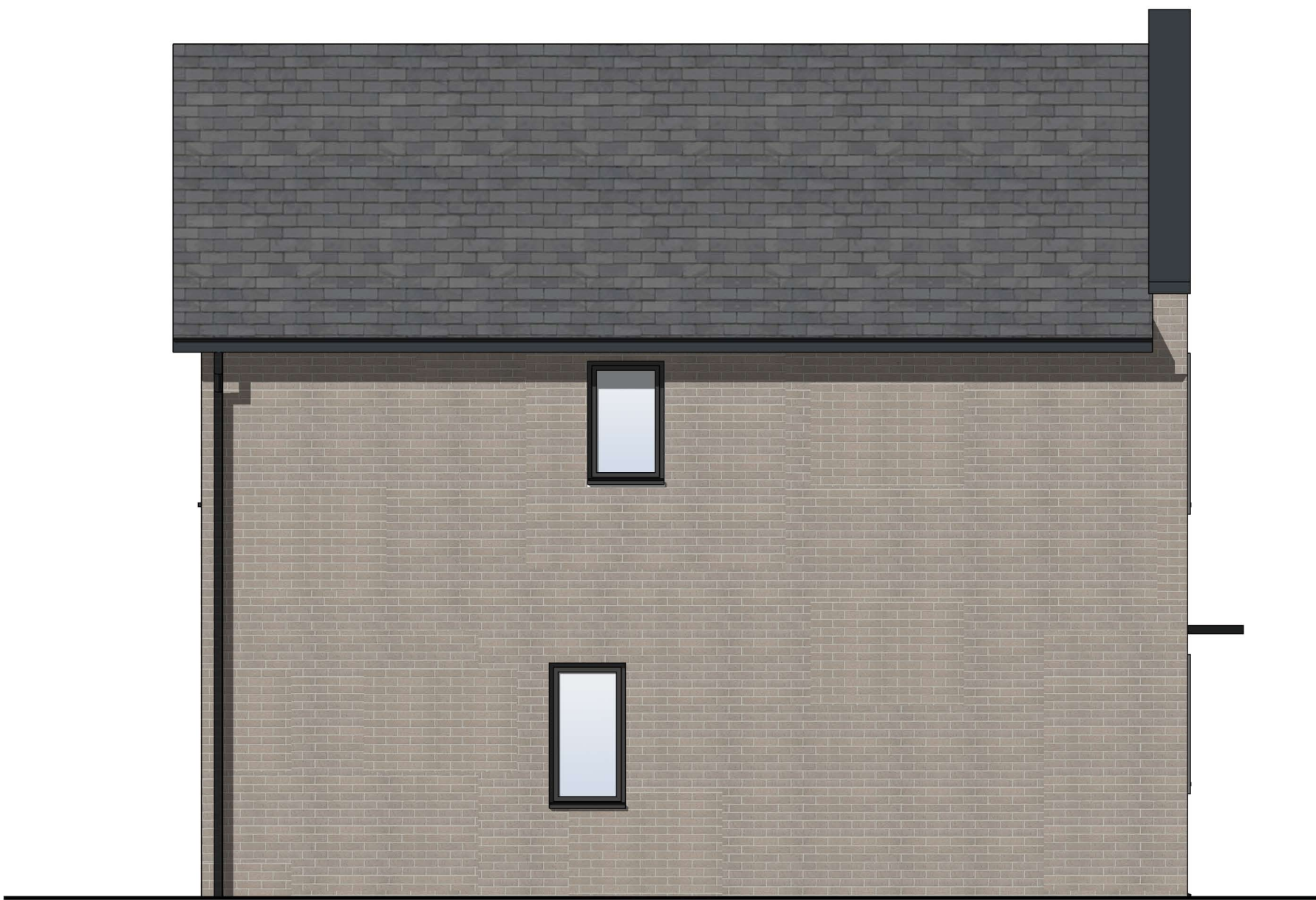
SIDE ELEVATION 1

general notes: do not scale from the drawing. all dimensions shall be checked on site prior to commencing works. all works shall conform to the current edition of the building regulations and other relevant statutory requirements. all materials and workmanship shall conform with the relevant british standard specifications and codes of practice. this drawing is the copyright of gdm architects and shall not be copied or reproduced without permission. this drawing shall be read in conjunction with gdm architect's health and safety risk assessments and all works shall be carried out in a safe manner, by competent persons. drawing produced by gdm architects ltd trading as gdm architects. Subject to site survey and LA approvals. © gdm architects ltd trading as gdm architects