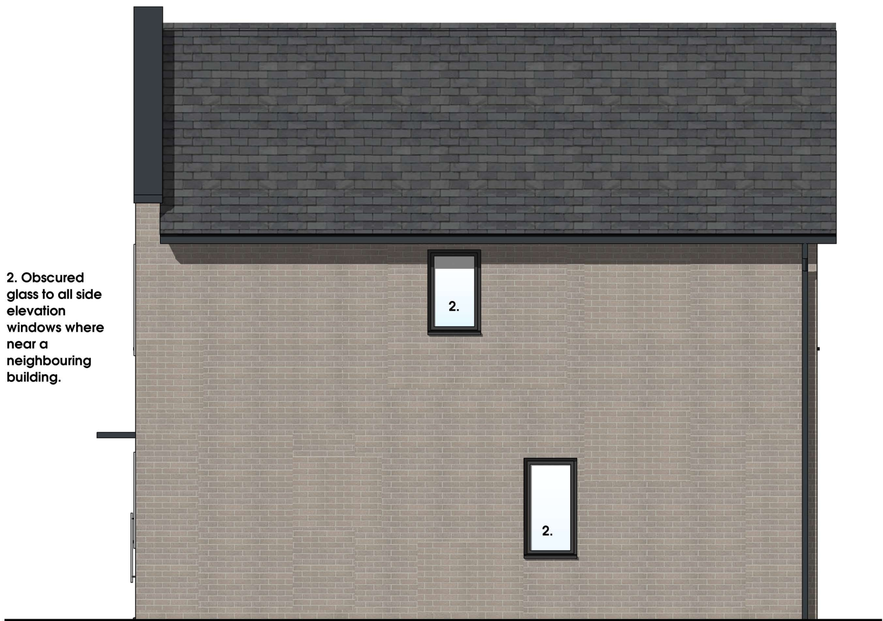
SIDE ELEVATION 2