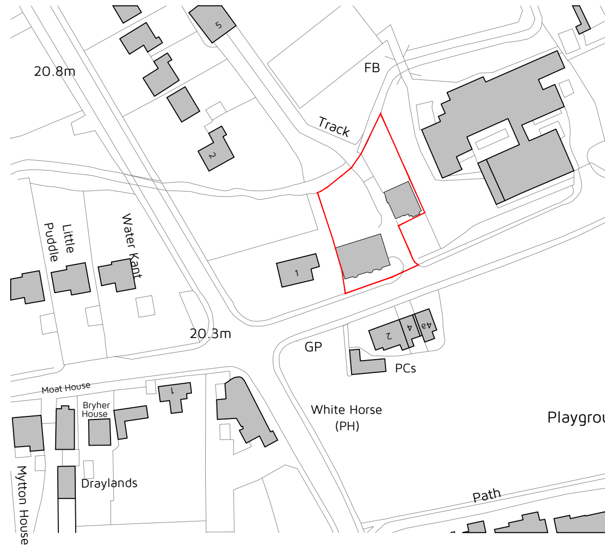
Proposed Figure Ground Plan