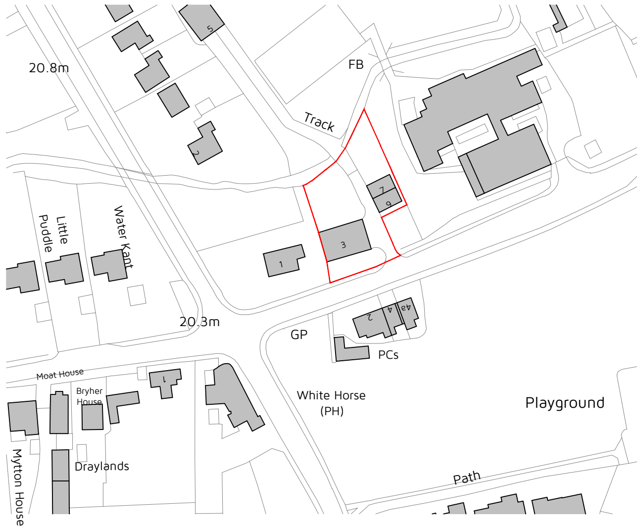
Existing Figure Ground Plan