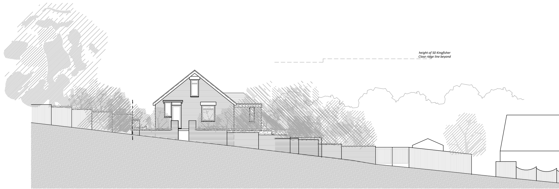
Existing Street (East Facing) Elevation 1:200