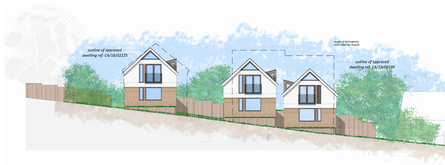
Proposed Street (East-Facing) Elevation 1:200