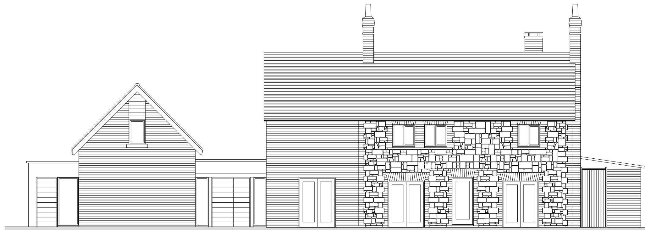
Existing East Elevation 1:100 @ A3