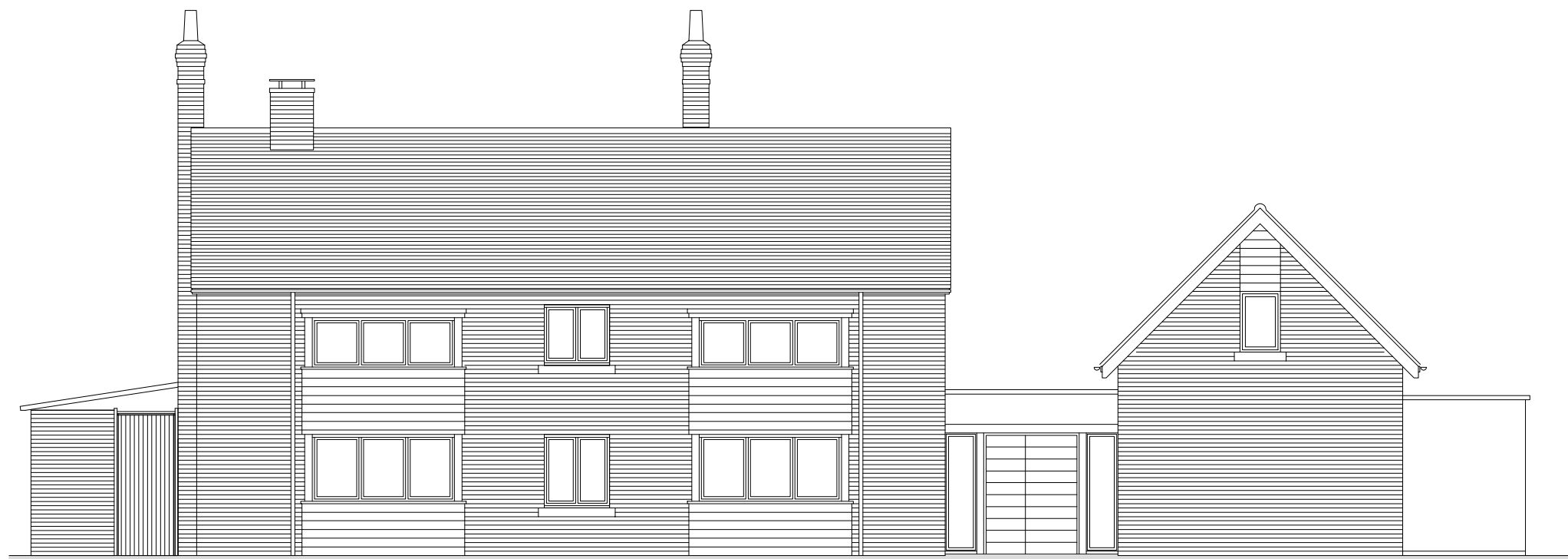
Existing West Elevation 1:100 @ A3