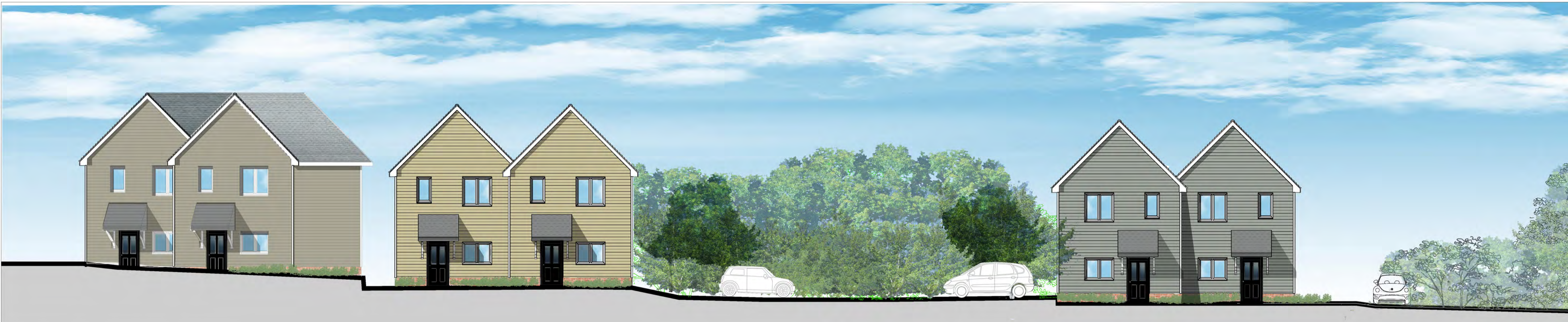
West Elevation - 1:100 @ A1 / 1:200@A3