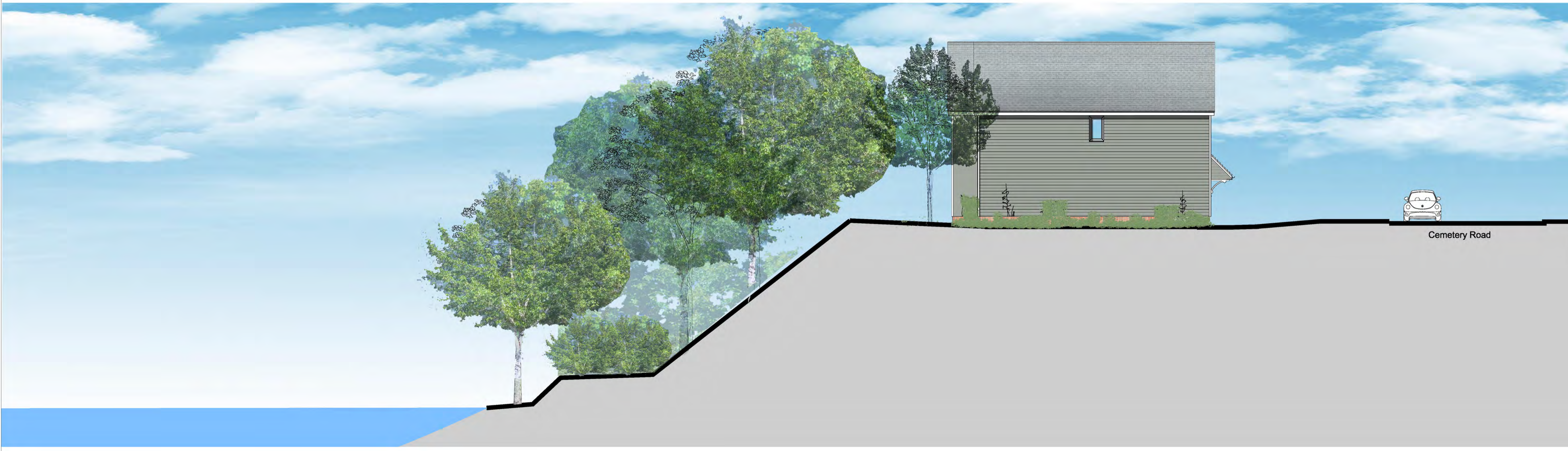
North Elevation - 1:100 @ A1 / 1:200@A3