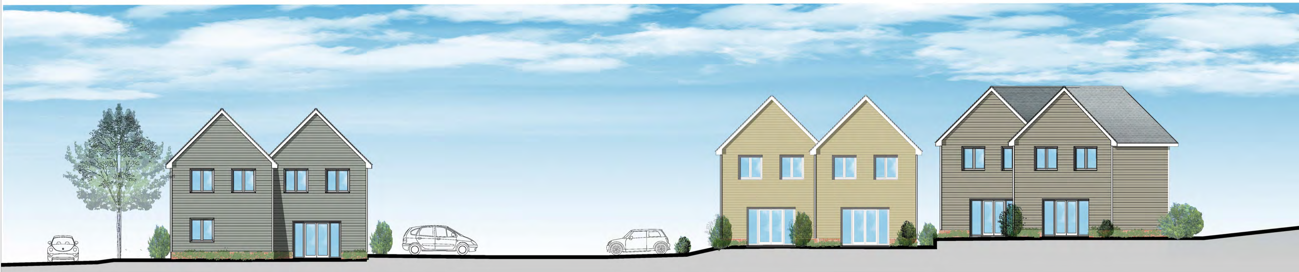
East Elevation - 1:100 @ A1 / 1:200@A3