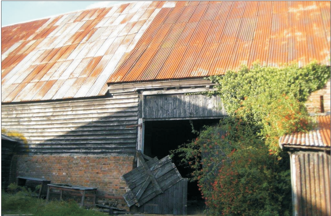
PHOTOGRAPH 2: Units adjoining building B1