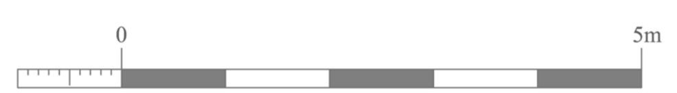
Barn 2 - Proposed south-west elevation (dwelling 2 (+ annexe)) Proposed conversion of existing barns at Queen Court Farm, Water Lane, Ospringe

Project Number 19.031 Drawing Number 58 Drawing Revision B