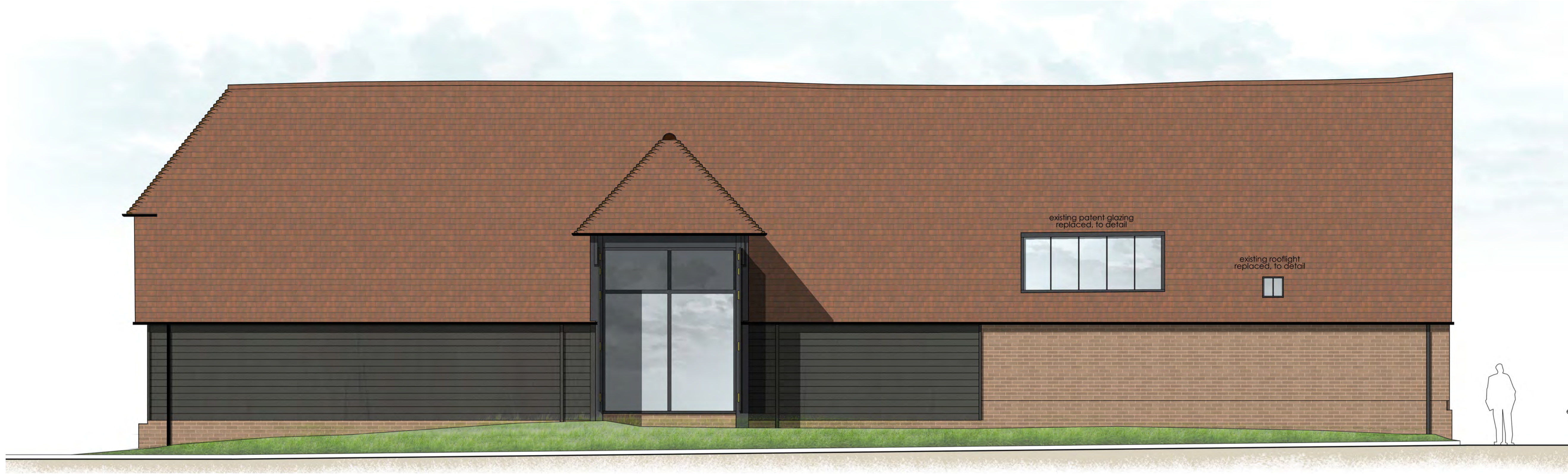
Proposed north-west elevation