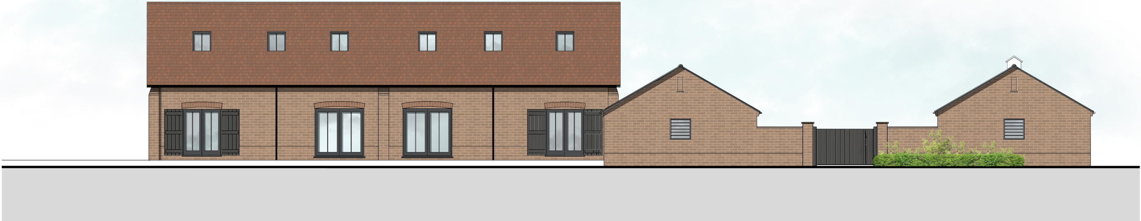
Rear (north-east) Elevation