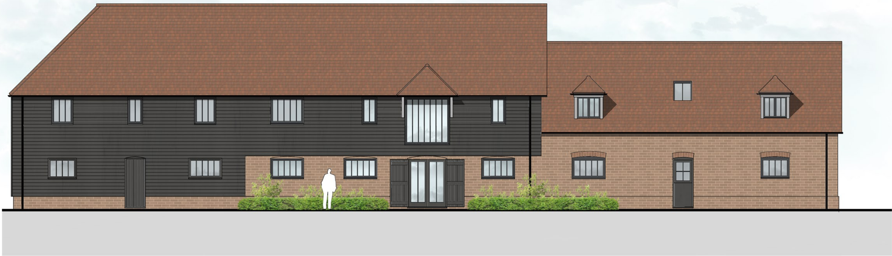
Front (north-west) elevation

This drawing and the design are the copyright of ON Architecture Ltd only. This drawing should not be copied or reproduced without written consent. All dimensions are to be checked on site prior to setting out and fabrication and ON Architecture Ltd should be notified of any discrepancy prior to proceeding further. For Construction & Fabrication Purposes - Do not scale from this drawing, use only the illustrated dimensions herein. Additional dimensions are to be requested and checked directly. Illustrated information from 3rd party consultants/specialists is shown as indicatively only. See other consultant / specialist drawings for full information and detail. All aspects of the architectural design concerning fire performance / fire safety (whether or not illustrated / annotated) are to be considered as 'For Approval' only, irrespective of the drawing status / suitability.