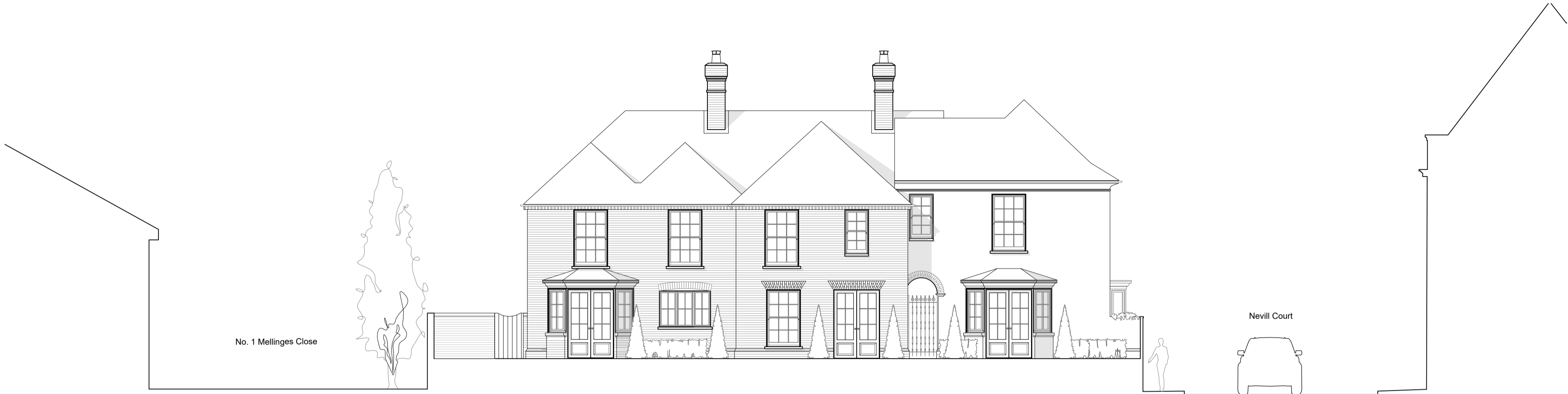
6 Rear (West) Elevation 1:100