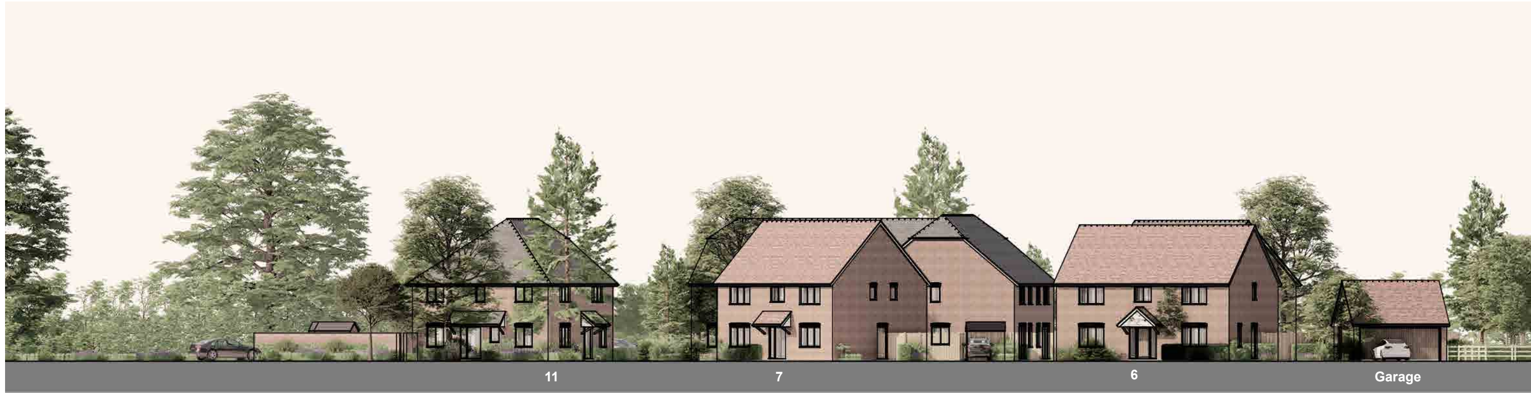
Street Elevation D-D - View looking north through the site