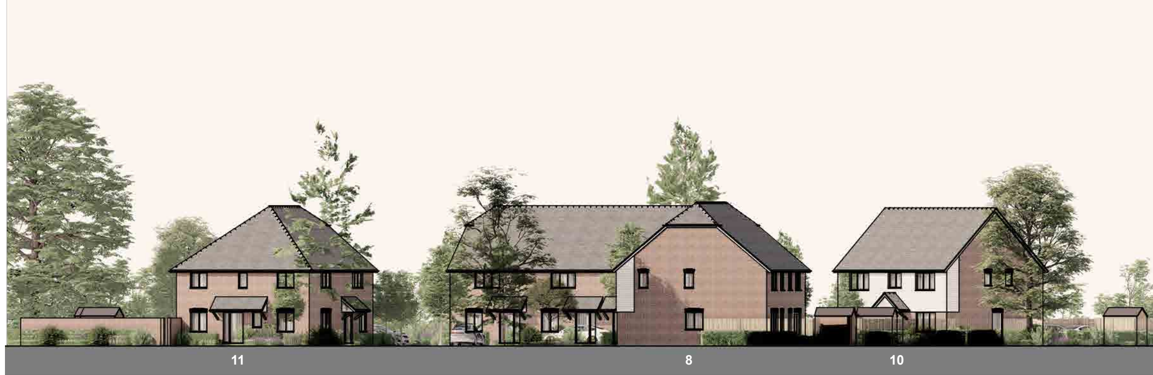
Street Elevation E-E - View looking north through the site