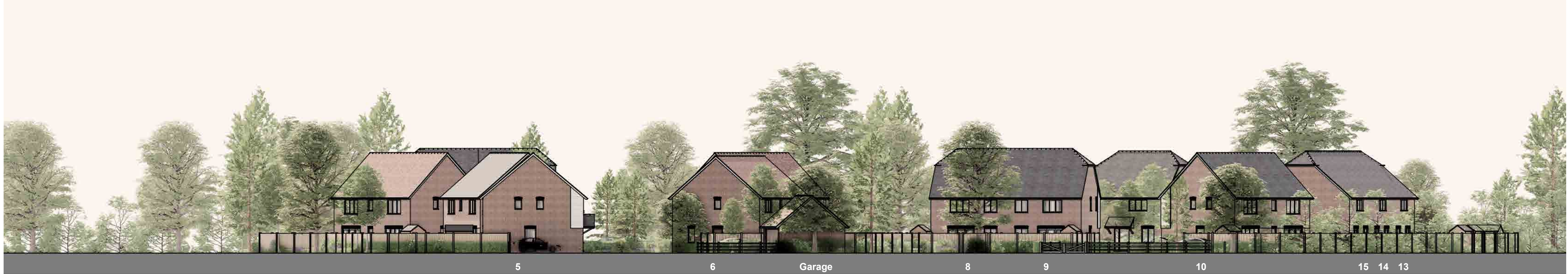
Street Elevation F-F - View looking west through the site