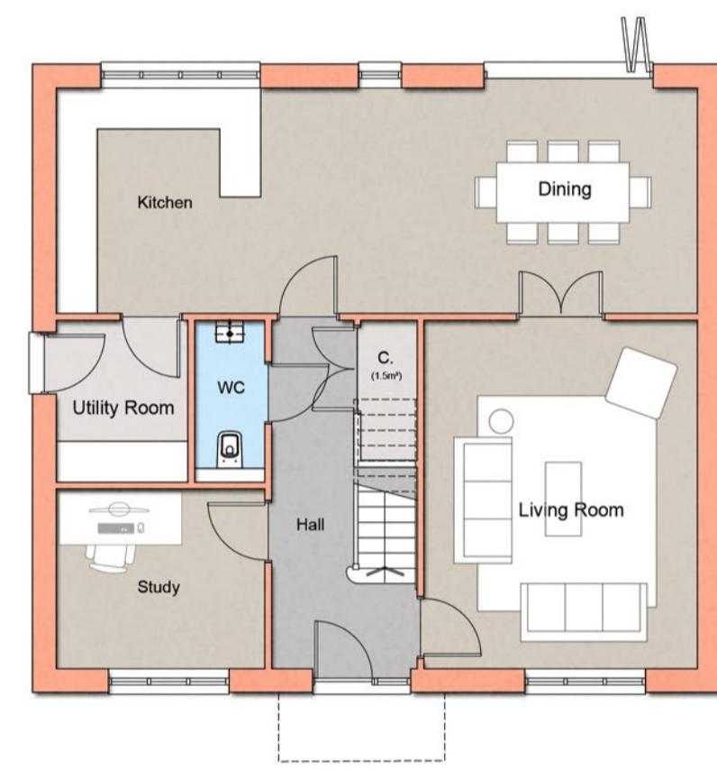
Ground Floor Plan Laxton - 4 Bedroom 7 Person House 160m 2 (1,725sqft)