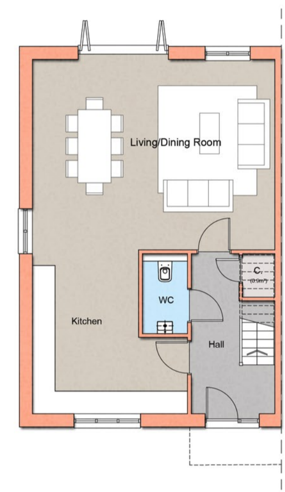
Ground Floor Plan Newton - 3 Bedroom 5 Person House 121m 2 (1306sqft)