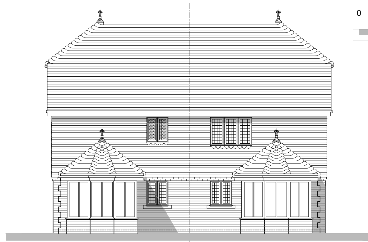
Unit 02 Unit 01