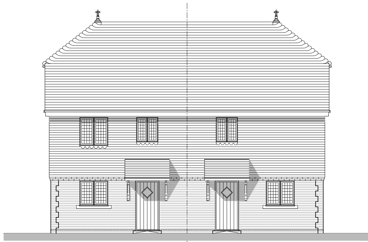
Unit 01 Unit 02