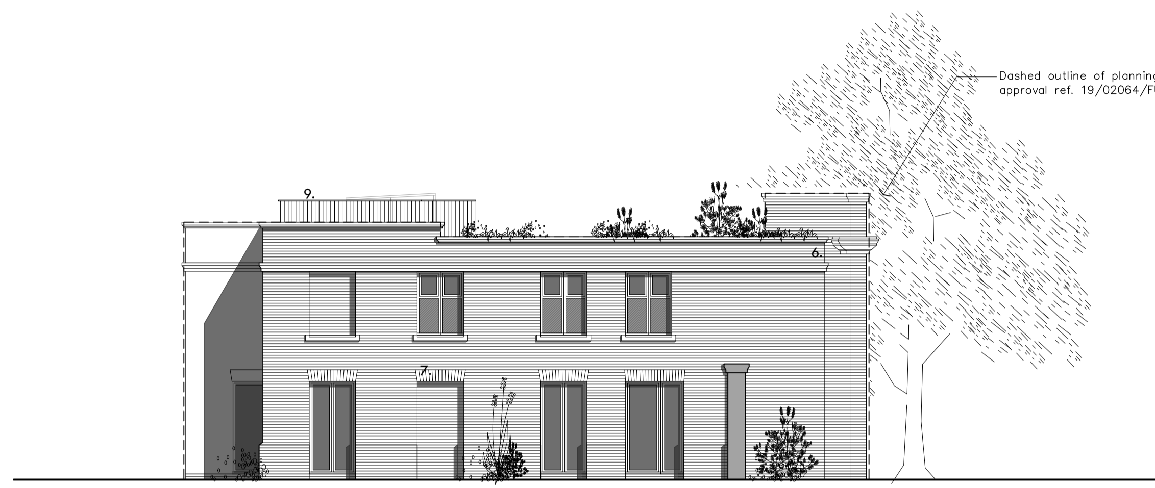
2 Flank Elevation (SE Facing)