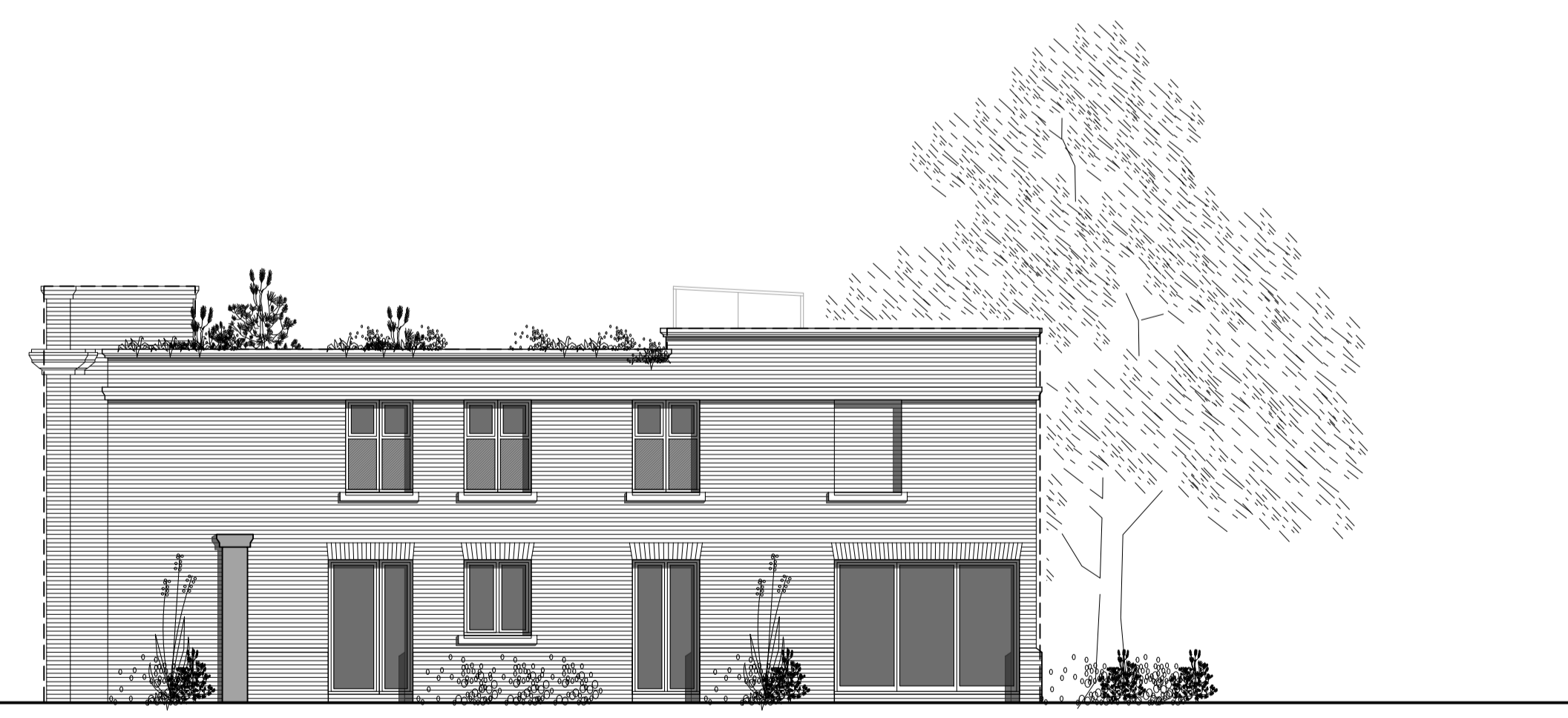
4 Flank Elevation (NW Facing)