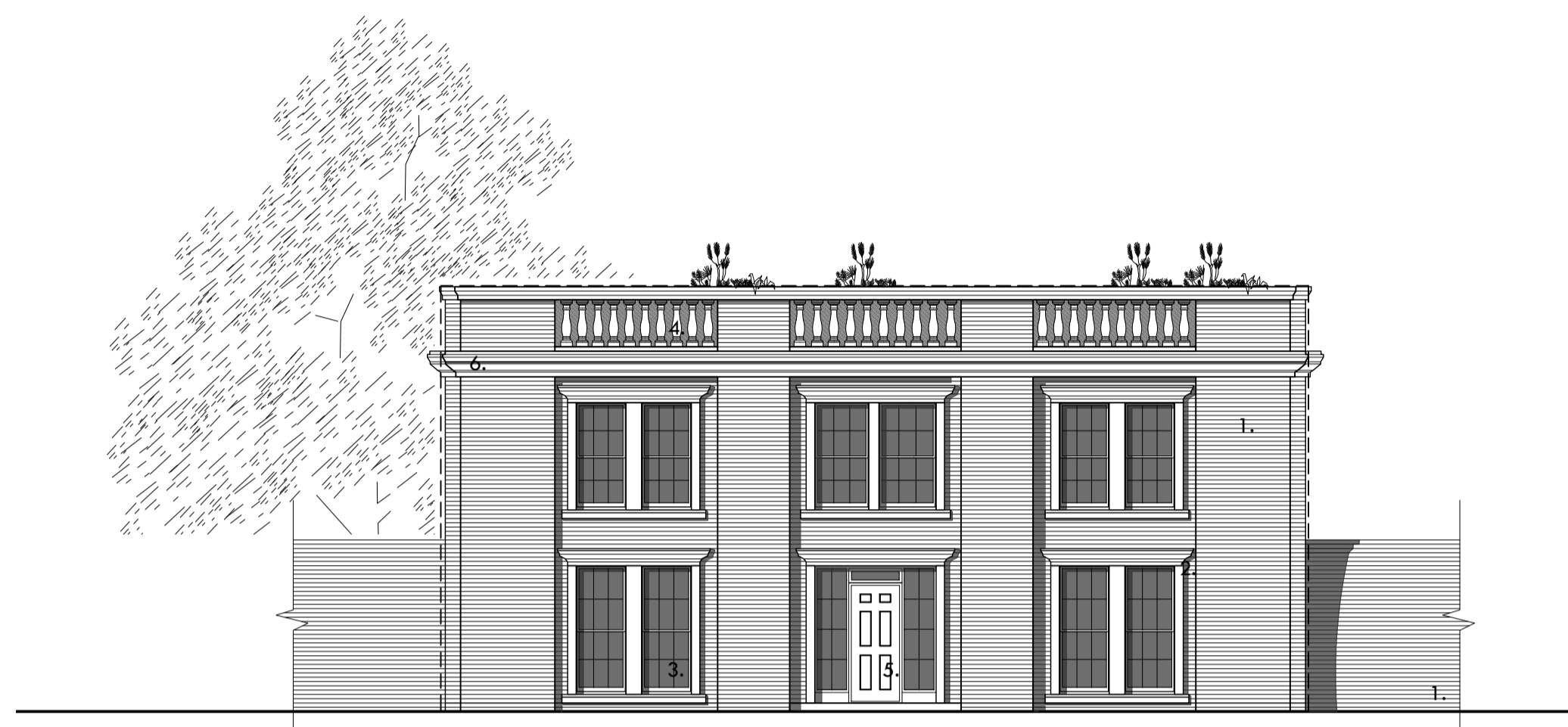
1 Front Elevation