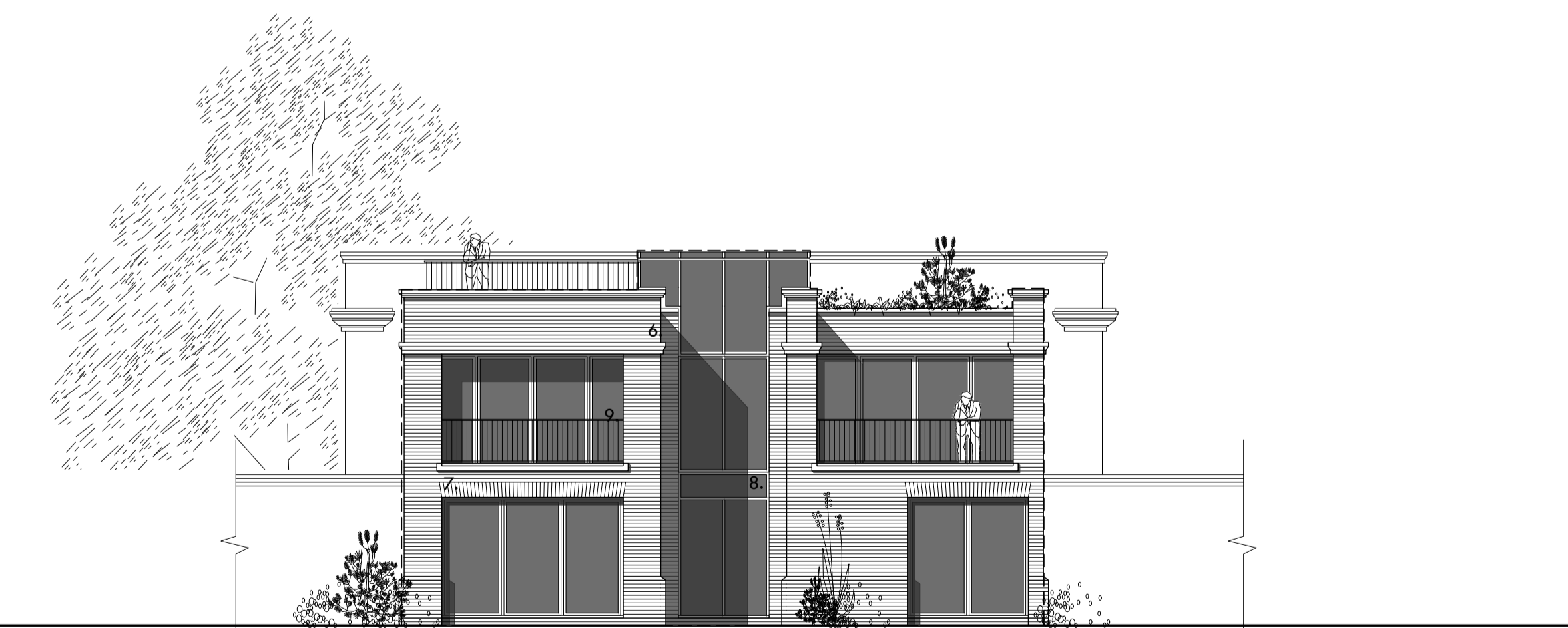
4 Rear Elevation