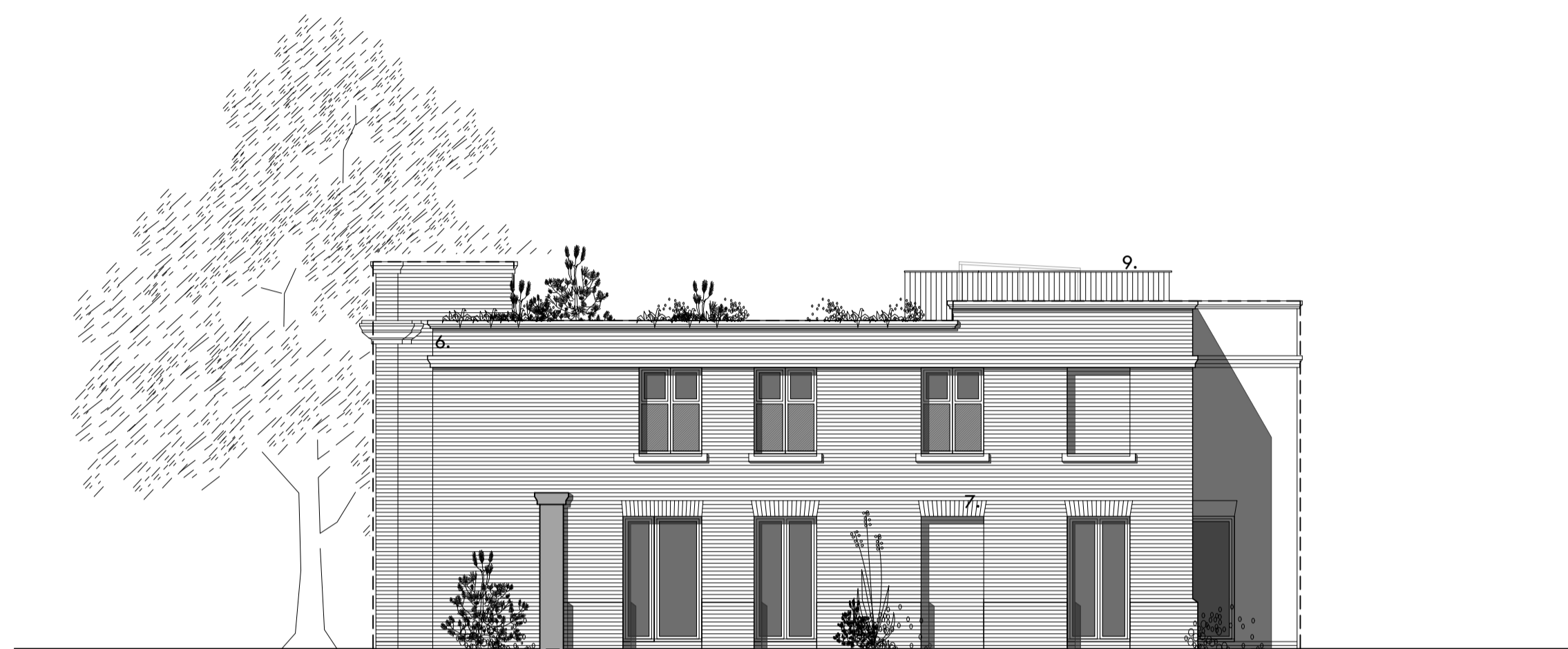
2 Flank Elevation (South Facing)