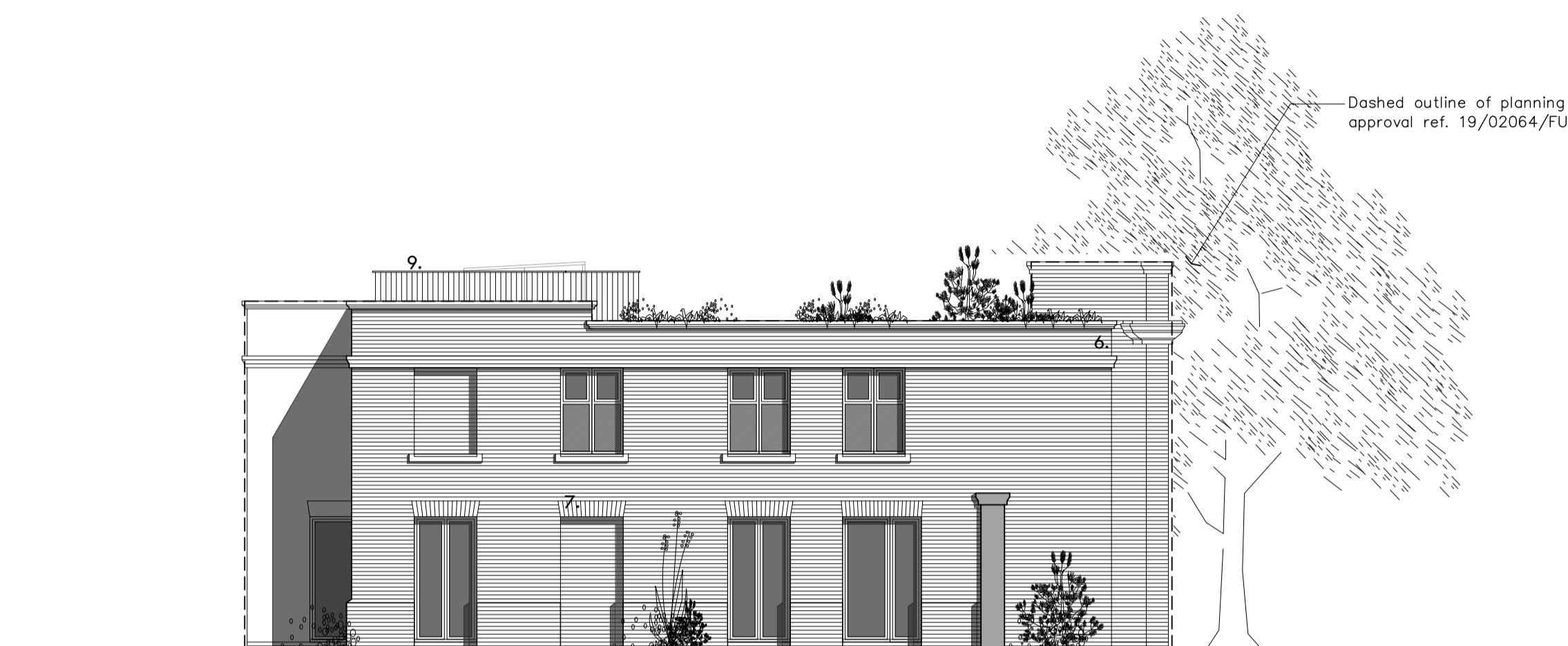
2 Flank Elevation (South Facing)