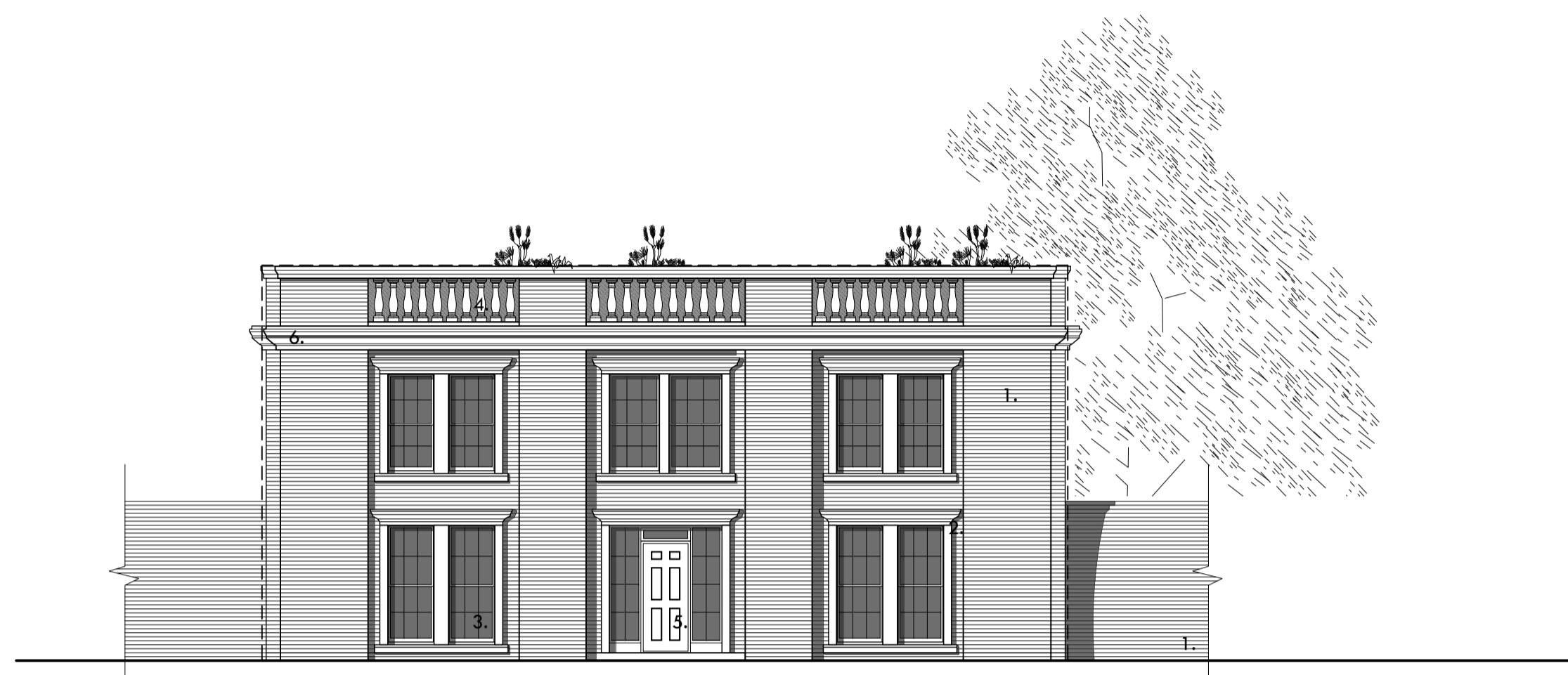
1 Front Elevation