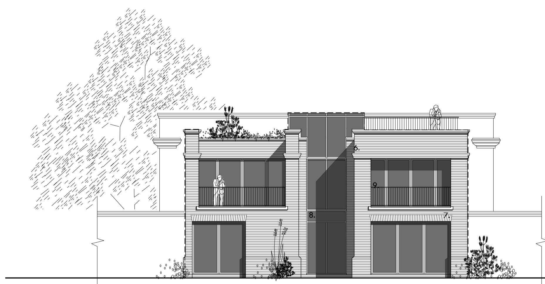
3 Rear Elevation