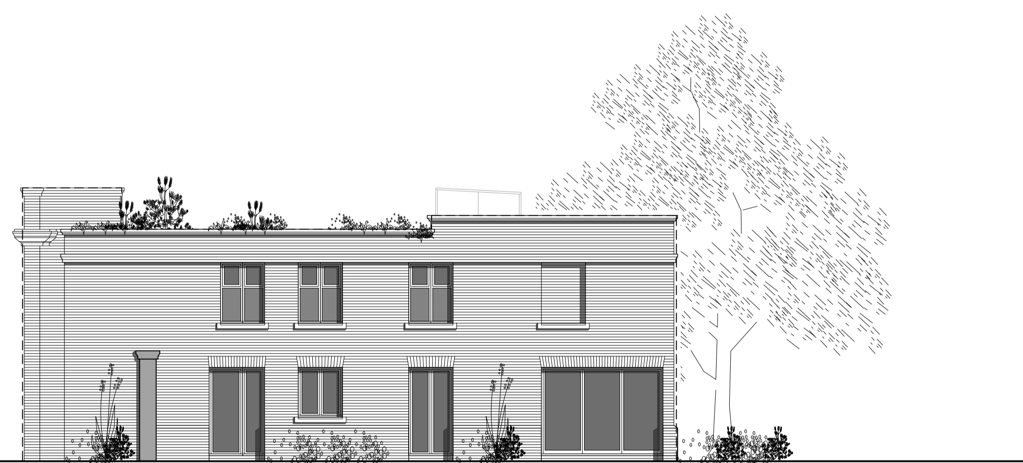
4 Flank Elevation (North Facing)

rev A 29.11.19 Revised following planning consultant comments