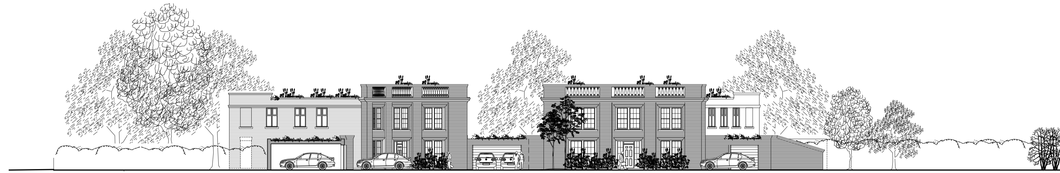
1 Site Elevation - Looking West