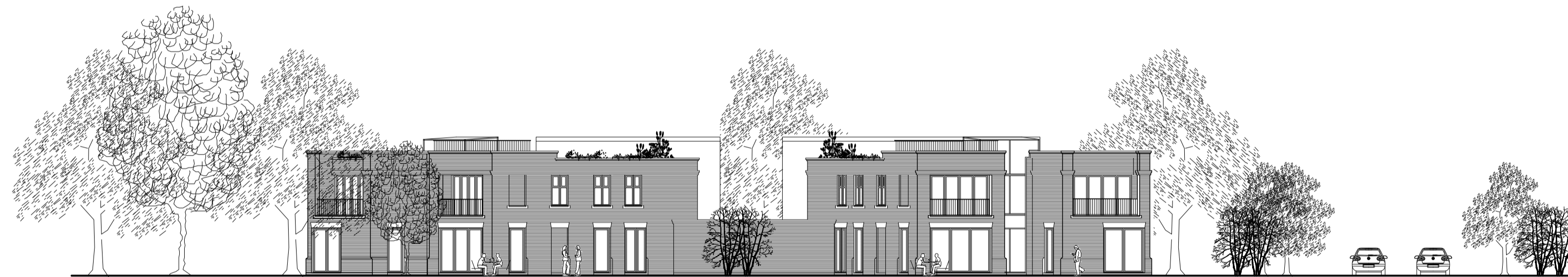
2 Site Elevation - Looking West