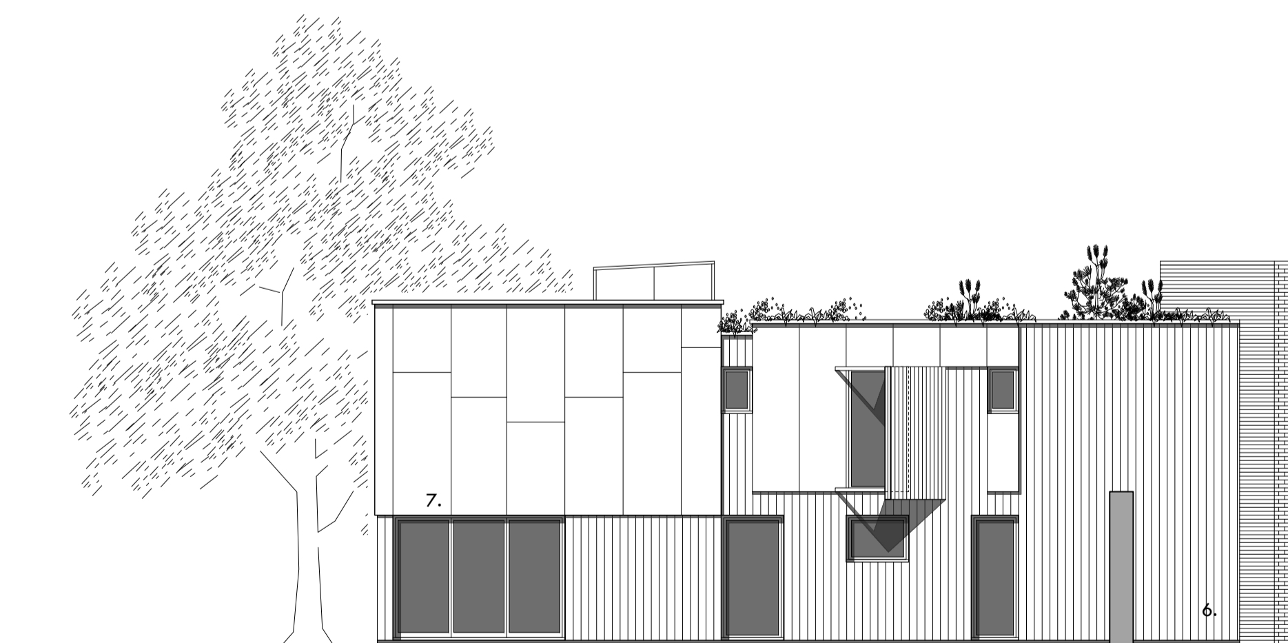
3 Flank Elevation (North Facing)