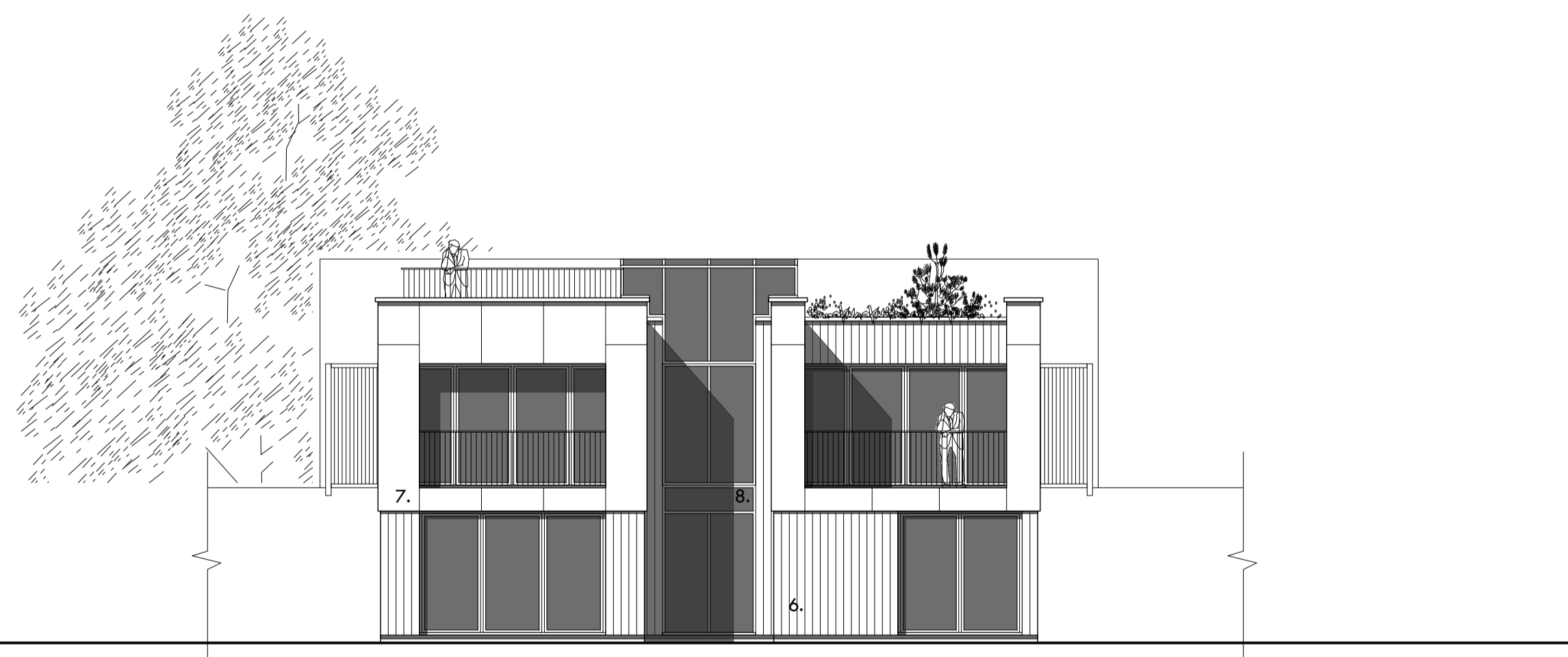
4 Rear Elevation