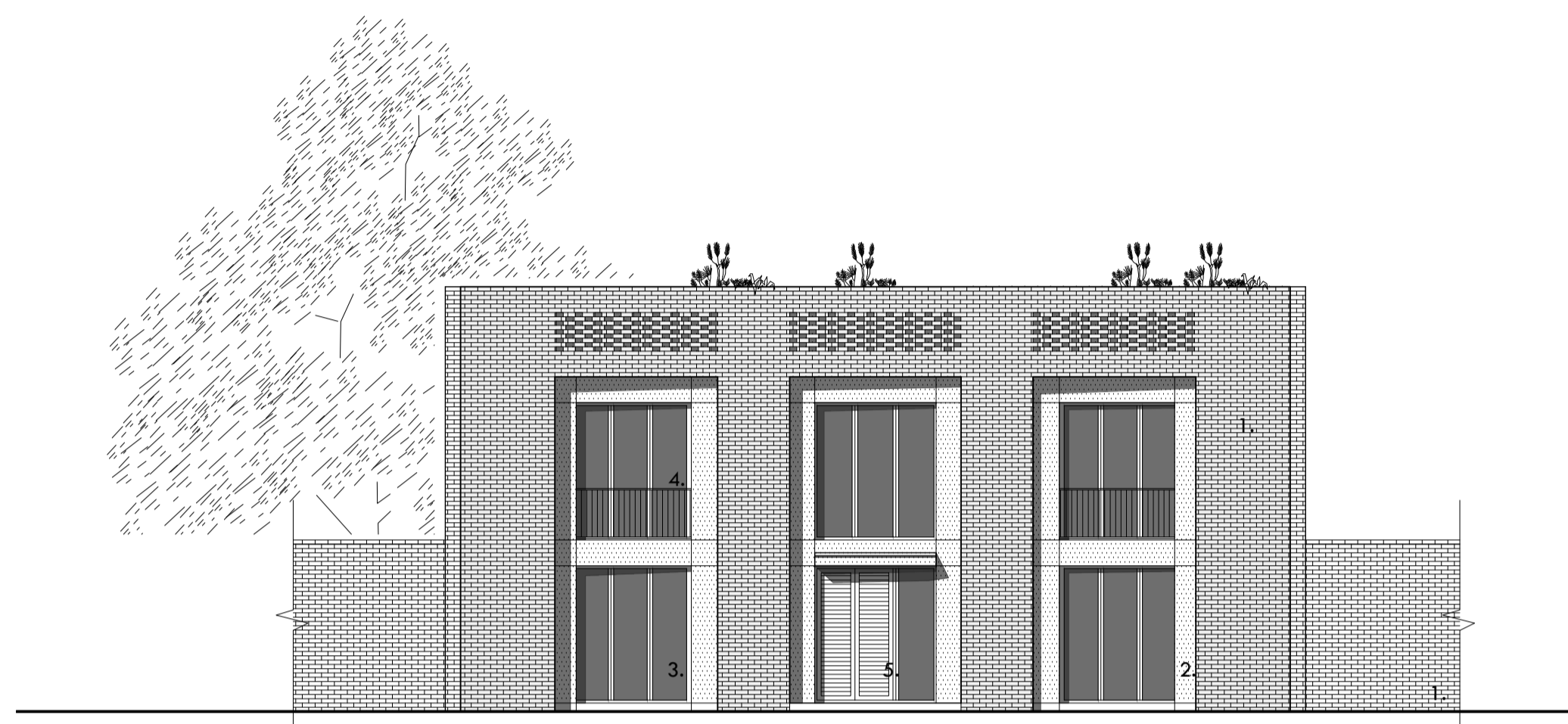
1 Front Elevation