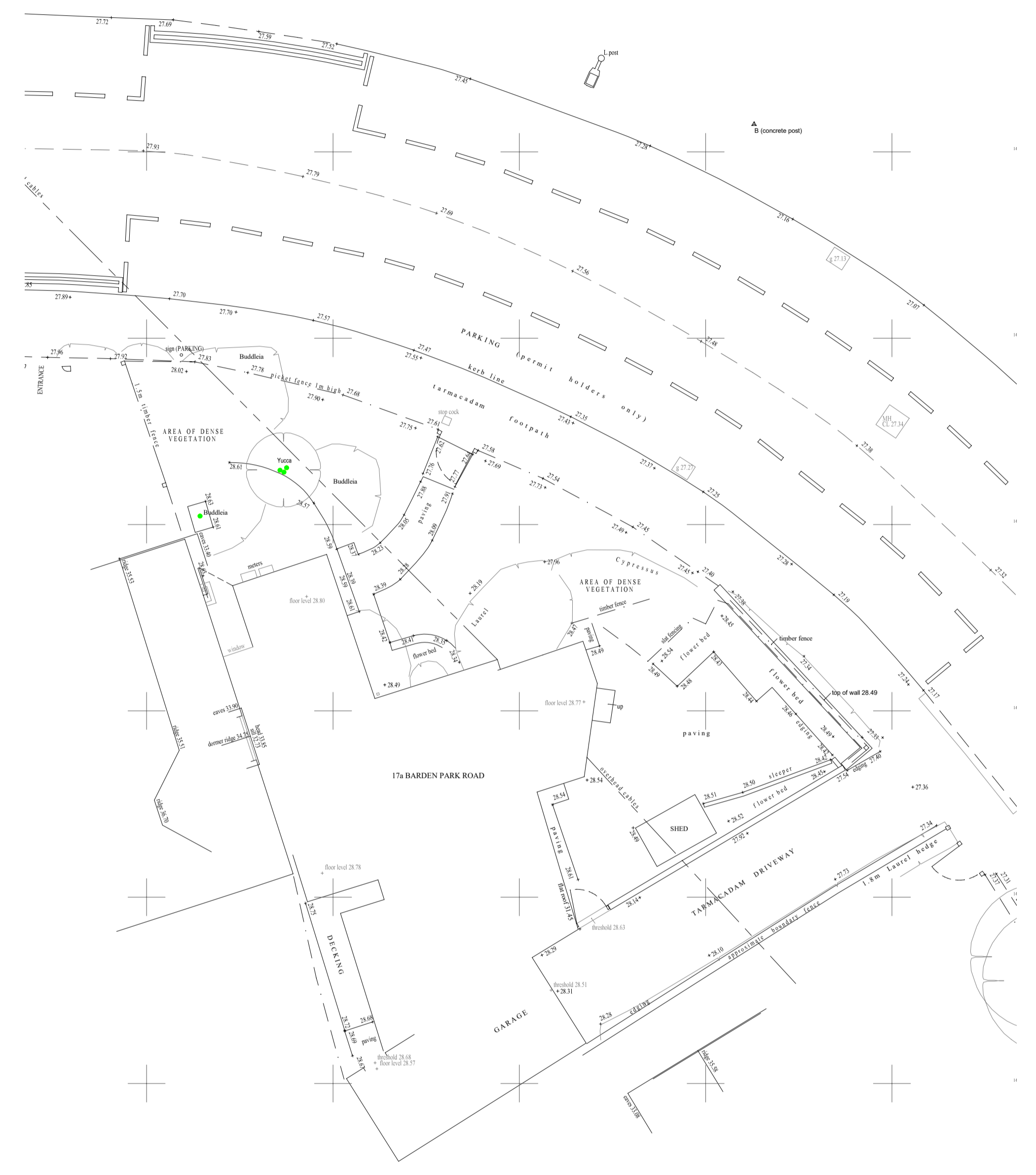
Existing Site Layout Plan - 1/100