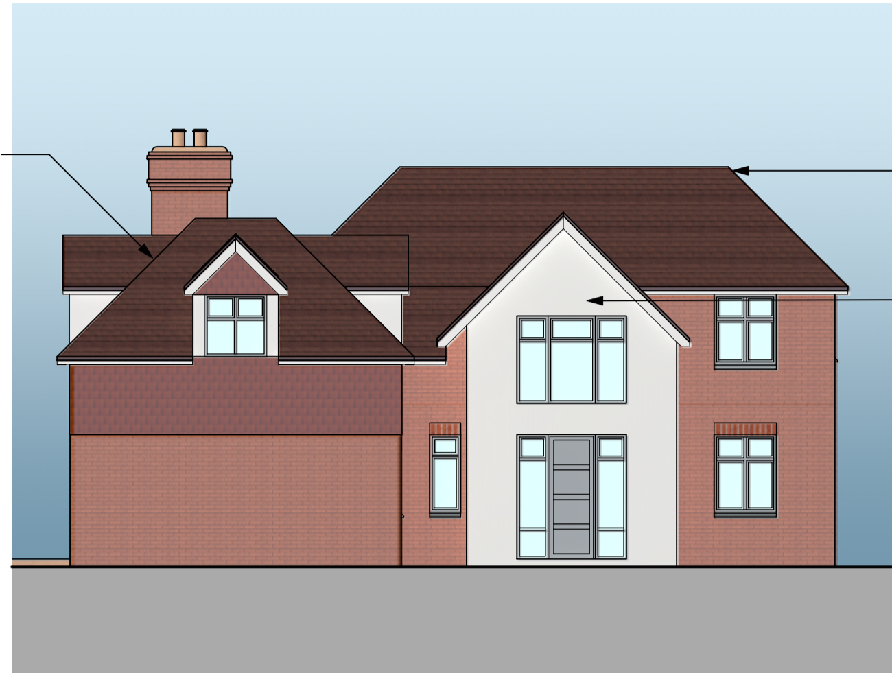
North East Elevation (facing Queens Rd.)

Garage wing roof reduced in height by 1.550mm (ridge) and eaves 700mm and full hipped end to Queens Rd. frontage with new dormer window