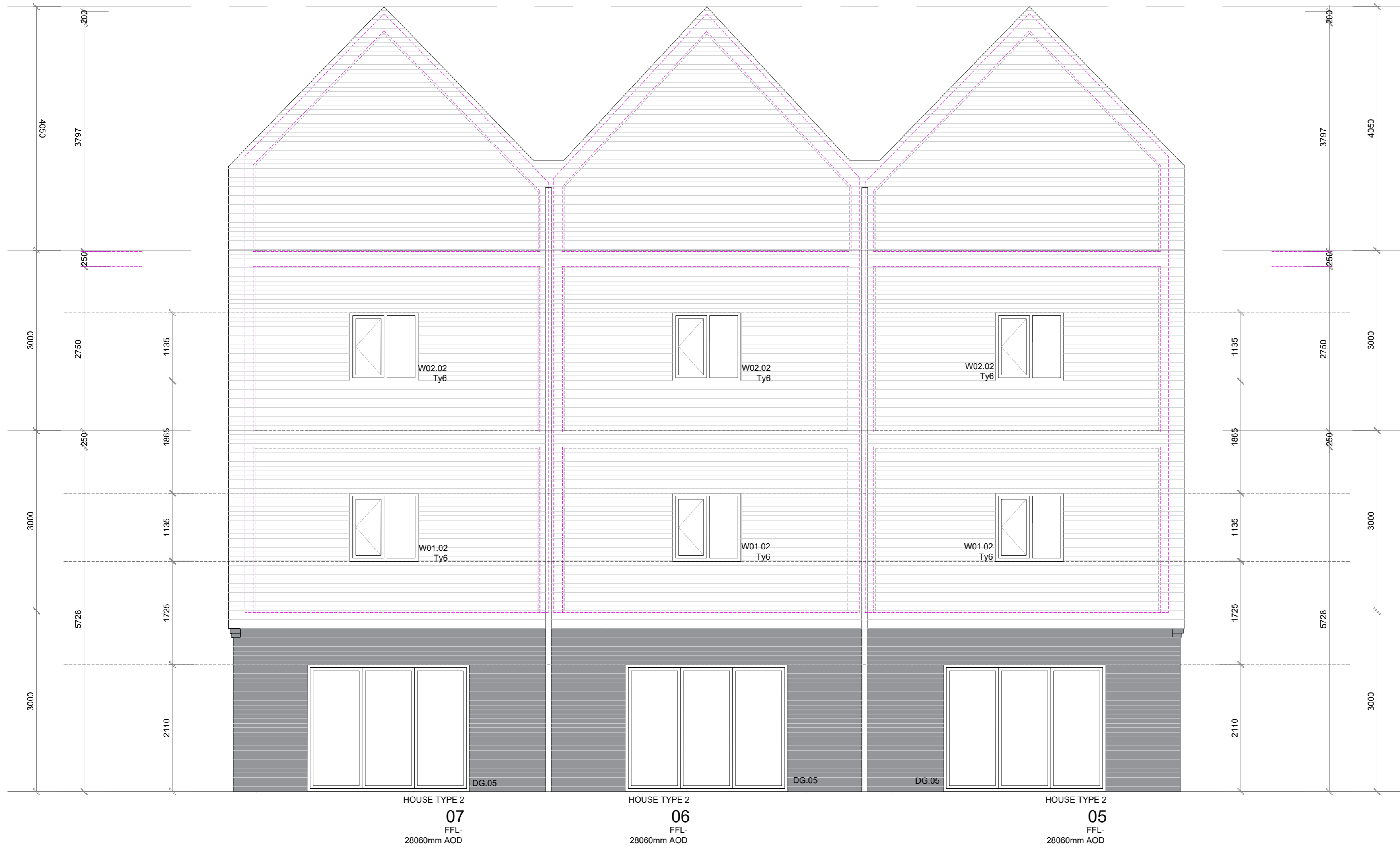
REAR ELEVATION @ 1:50