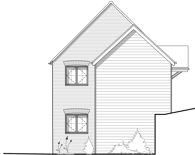
East Elevation Scale 1:100 @ A3