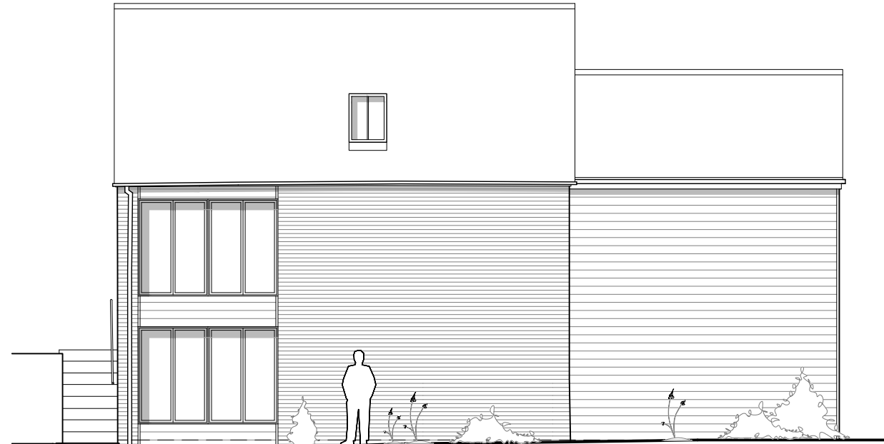
South Elevation Scale 1:100 @ A3