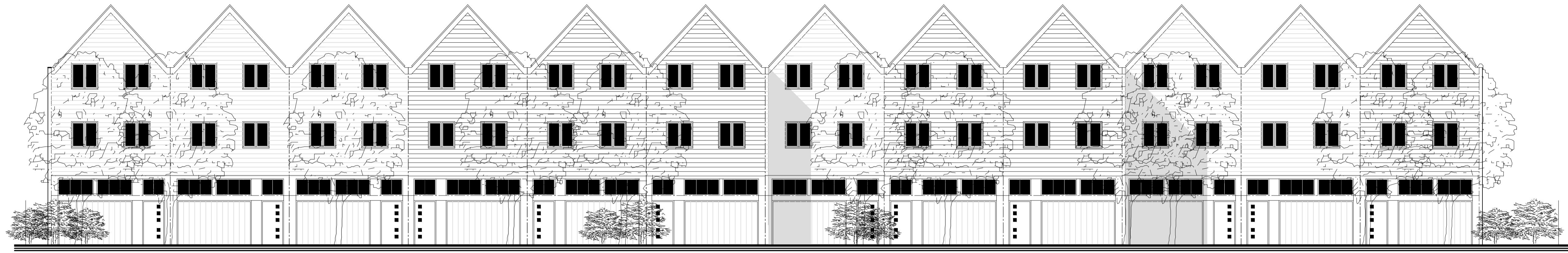
Block North Front Elevation (to Forstal Road) 1:100

Notes 1. This drawing is the property of GBA Designs Limited. Copyright is reserved by them and this drawing is issued on the condition that it is not reproduced or copied in part or in whole without their written consent. Do not scale from this drawing. All dimensions to be checked on site before commencement of work. This drawing is to be read in conjunction with specifications and/or other consultants drawings as applicable.