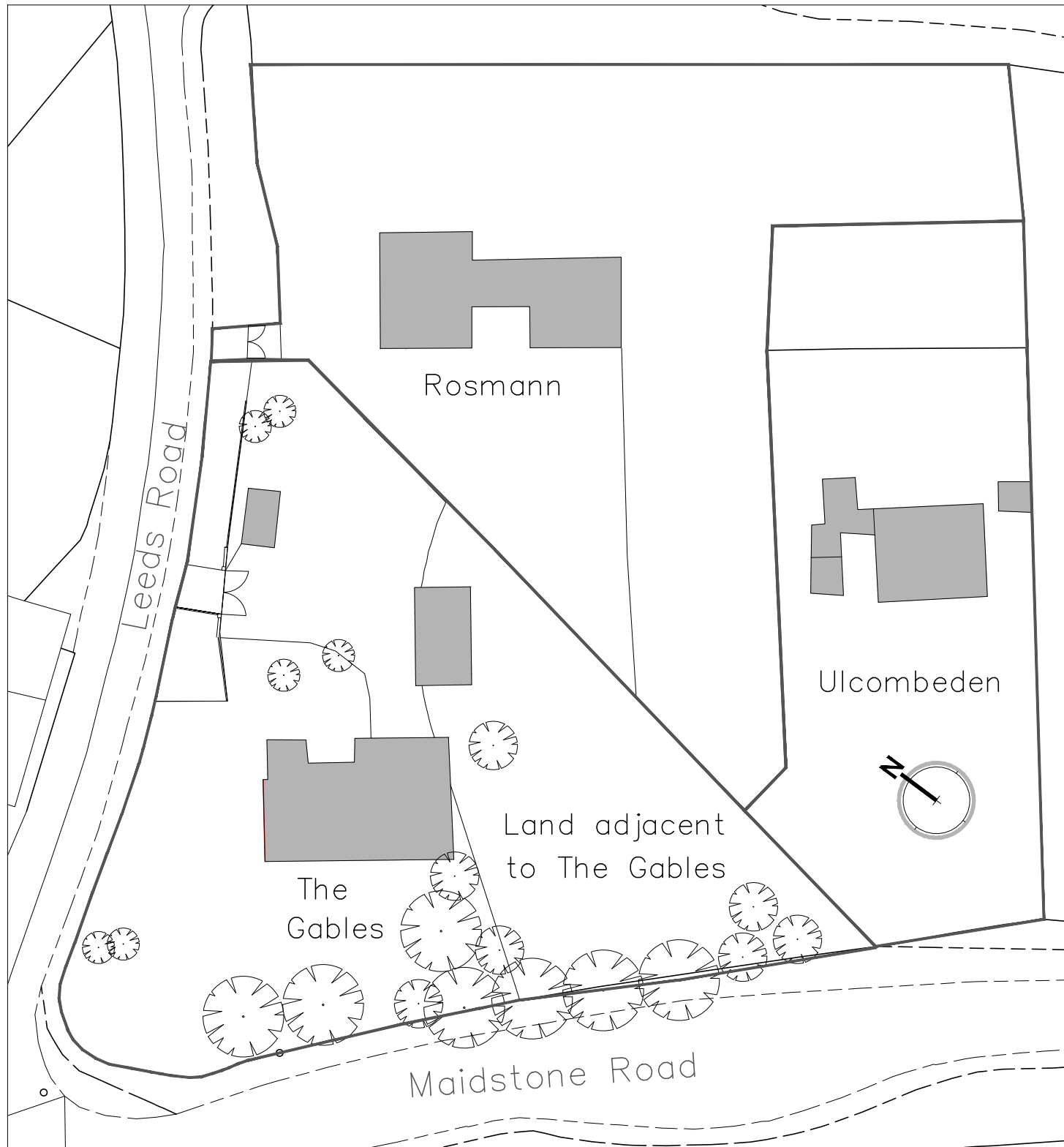
existing block plan