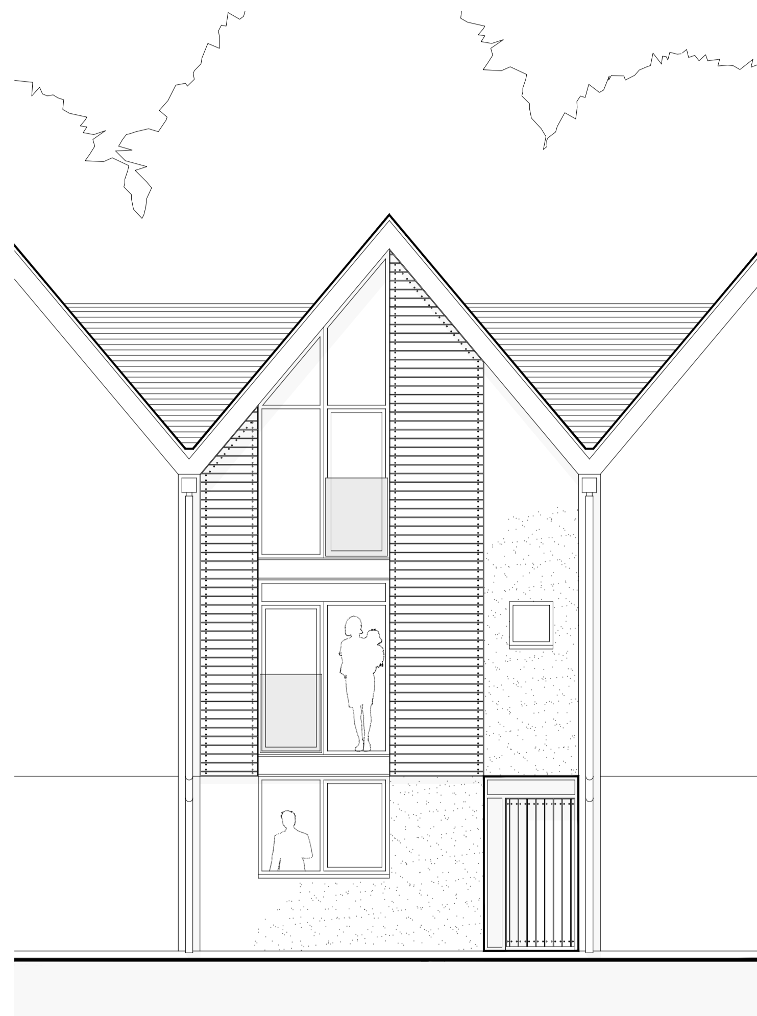
FRONT BAY STUDY @ 1:50