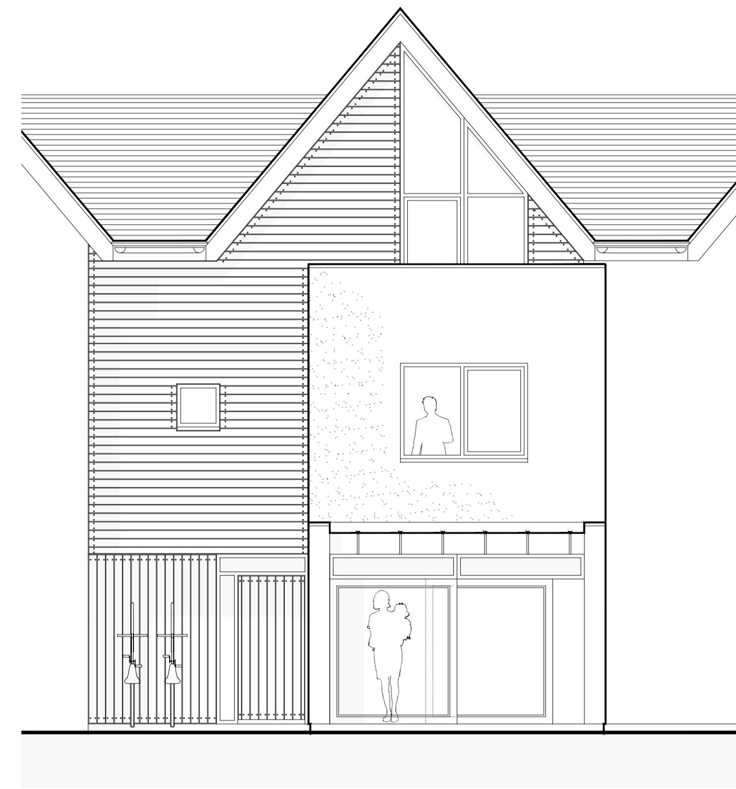
REAR BAY STUDY @ 1:50