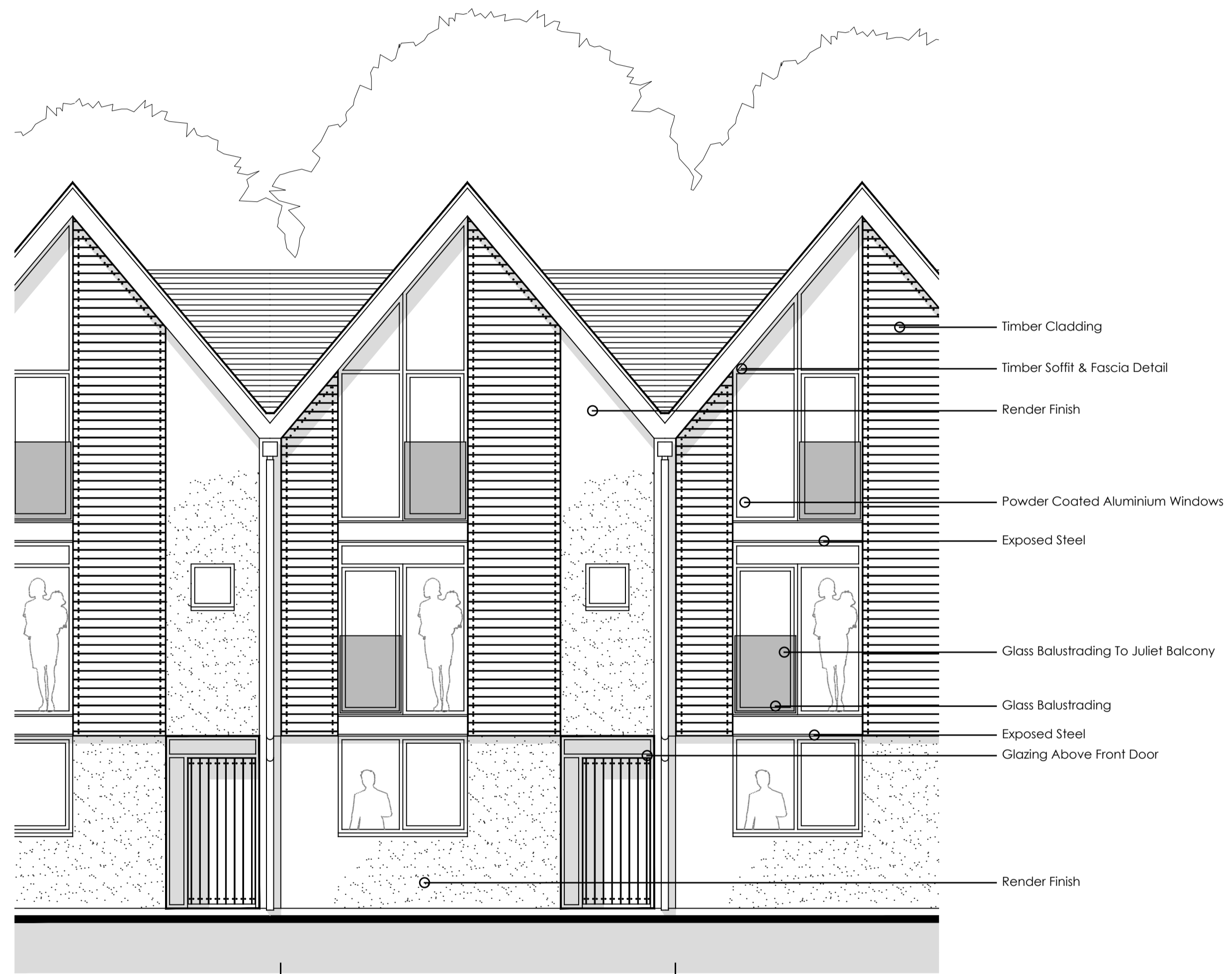
FRONT BAY STUDY @ 1:50