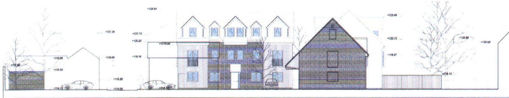
ELEVATION 3-3 Still Lane 24A London Road Frederick's Barn Block B Block A