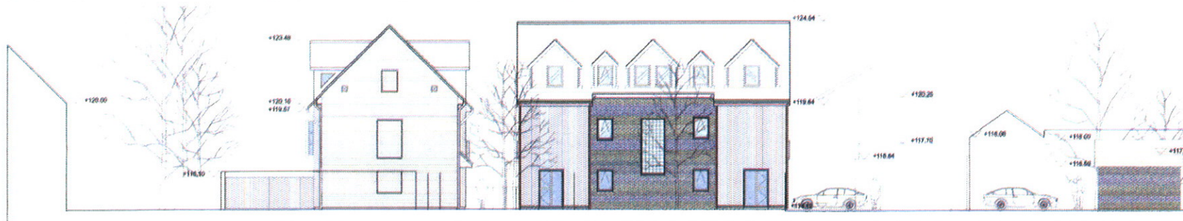
ELEVATION 4-4 Block A Block B 24A London Road Frederick's Barn Refuse / Cycle store