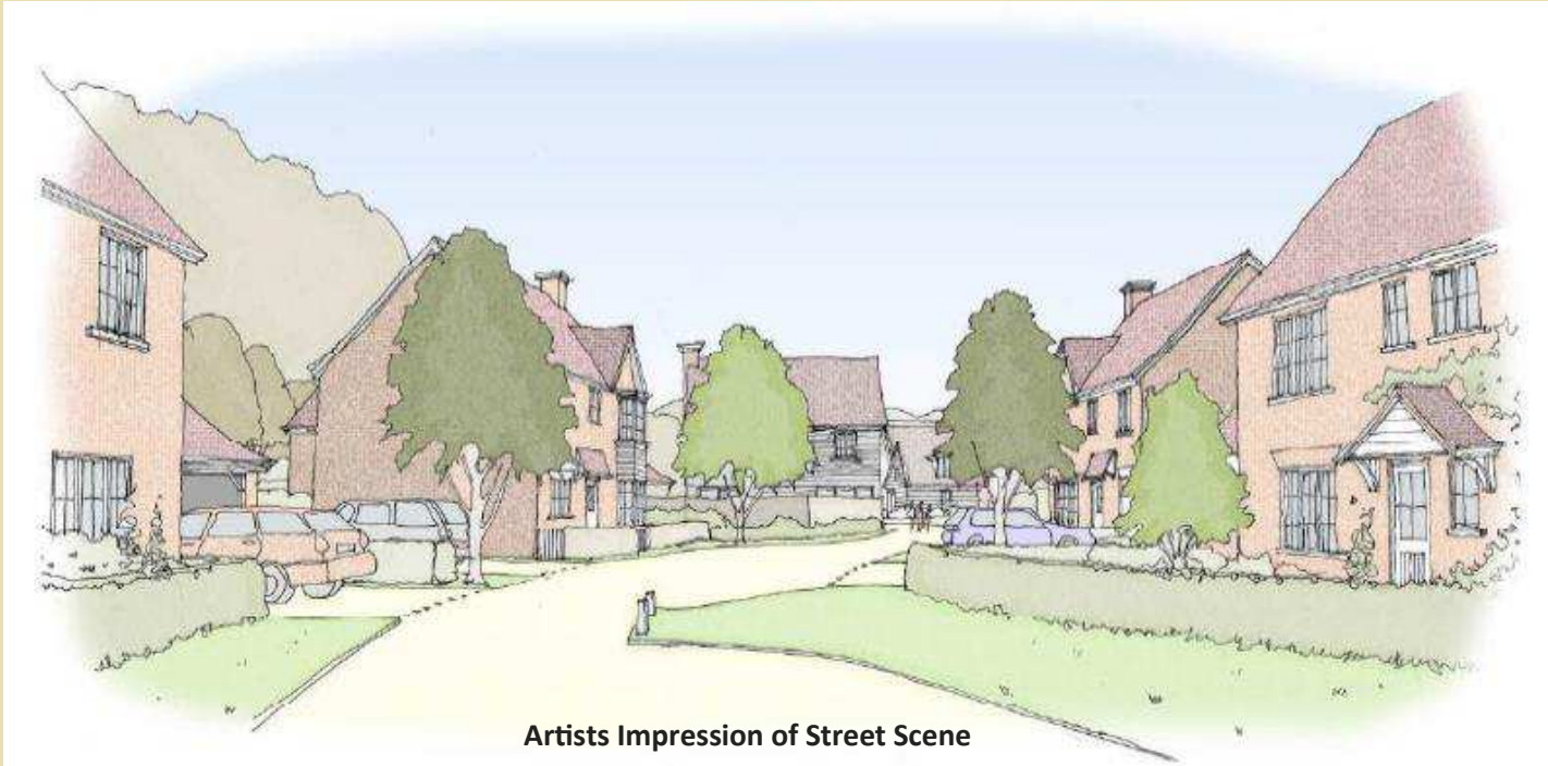
Artists Impression of Street Scene

A resolution to grant planning consent subject to the signing of a Section 106 agreement was granted by Maidstone Borough Council under reference number 16/501263/FULL, on the 4th August 2016 for 25 dwellings. In addition, planning permission has been granted by Maidstone Borough Council under reference number 14/504397/FULL for the property and the access of the site known as The Pest House which is a Grade Two listed cottage for part new extension and to total refurbishment. Listed building consent has also been granted under reference 14/504406/LBC.